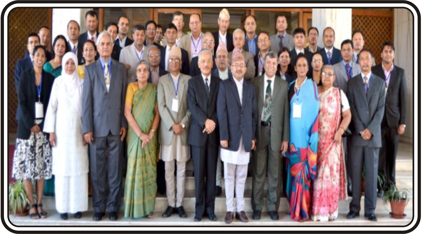
A group photo of DG, FJA with the participants of the conference at Nepal