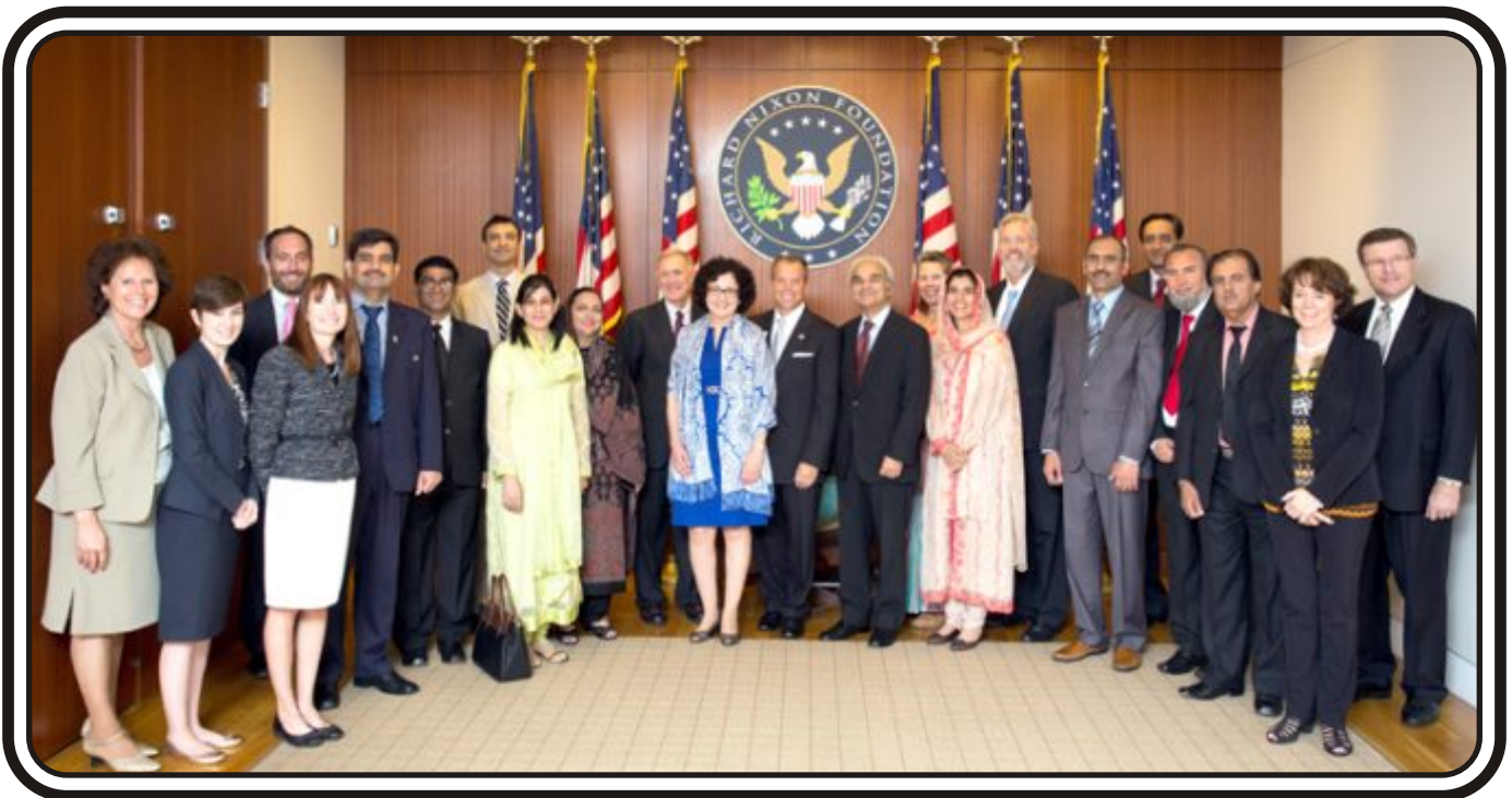
A group photo of the participants of the Judicial Exchange Program at U.S.A