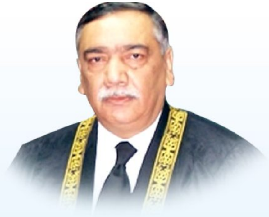
Hon'ble Mr. Justice Asif Saeed Khan Khosa