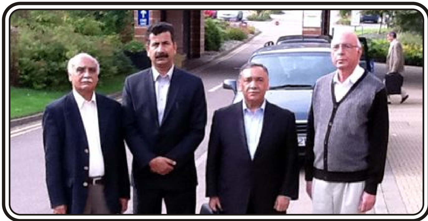
A Pakistani delegation headed by Hon'ble Mr. Justice Asif Saeed Khan Khosa at Warwick University during Judicial Training Study Tour of United Kingdom and Ireland