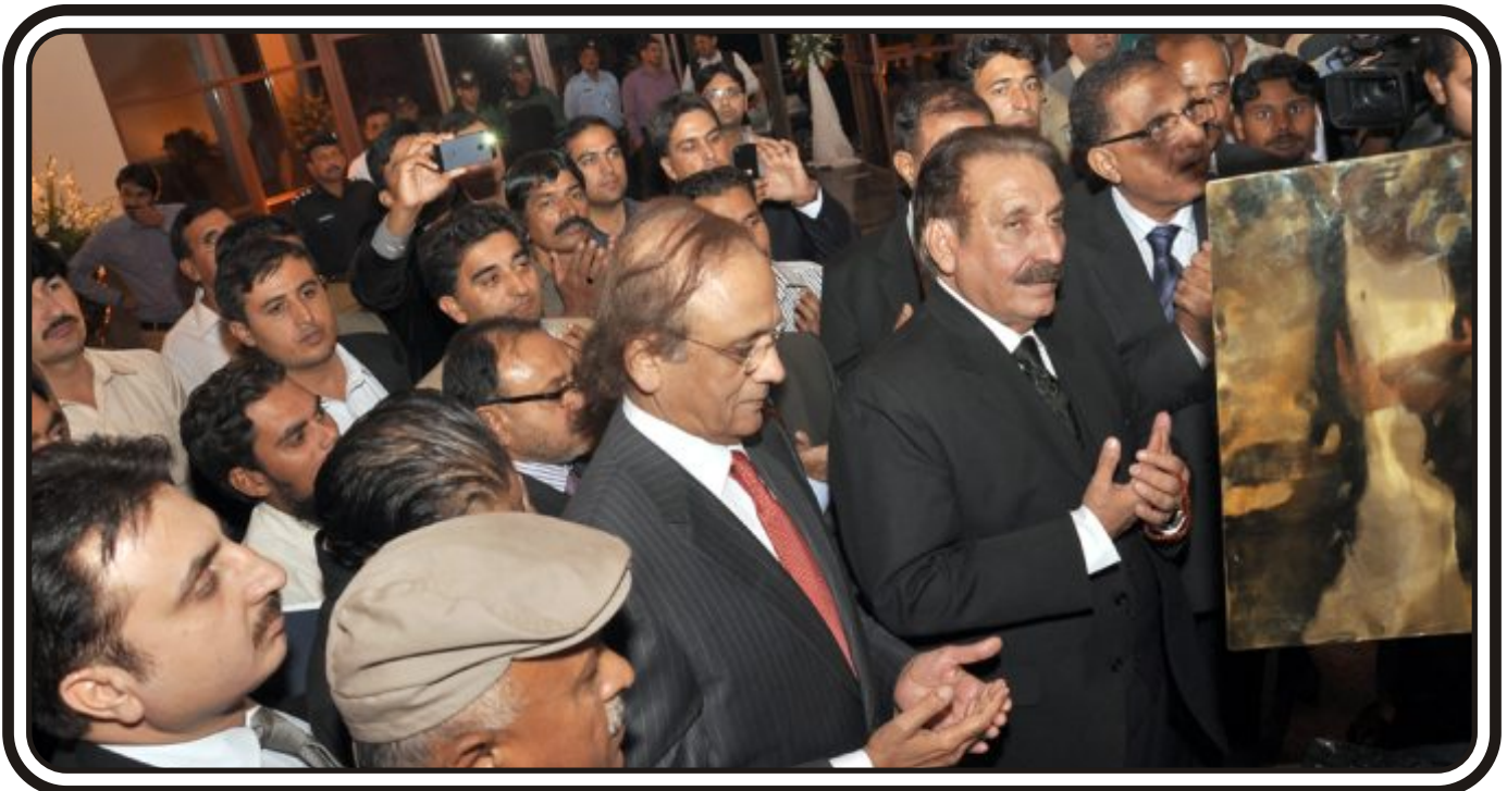
Hon'ble two former CJPs and others: Unveiling the plaque and praying for the future prospects of the newly constructed FJA-Phase -II