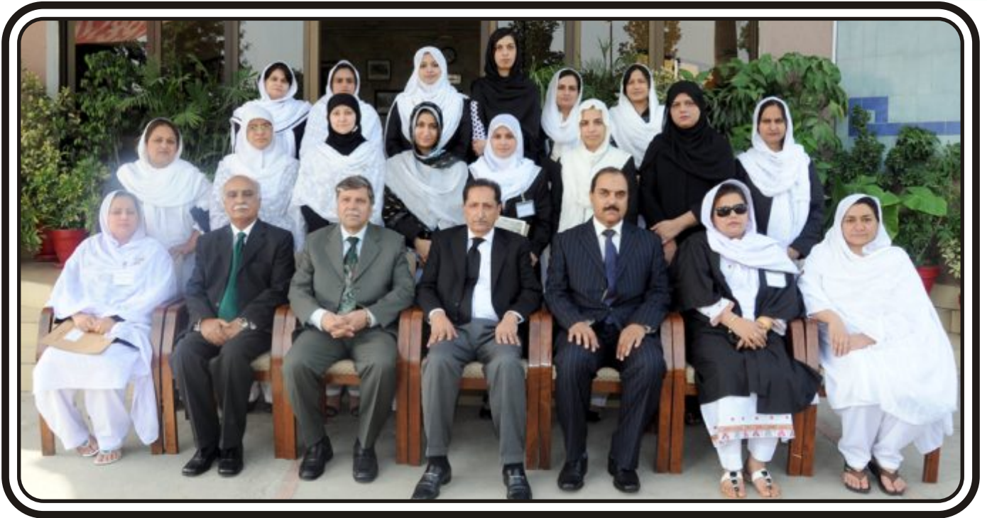
Family Court Judges from all over Pakistan in group photo with Mr. Justice Ejaz Afzal Khan, Hon'ble Judge, Supreme Court of Pakistan and faculty members of the CELJE/FJA