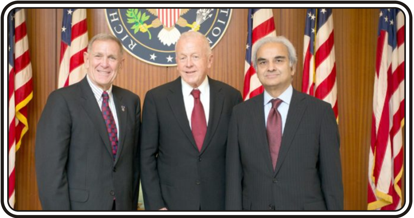
Hon'ble Mr. Justice Nasir-ul- Mulk, Chief Justice of Pakistan, during Judicial Exchange Program at U.S.A.