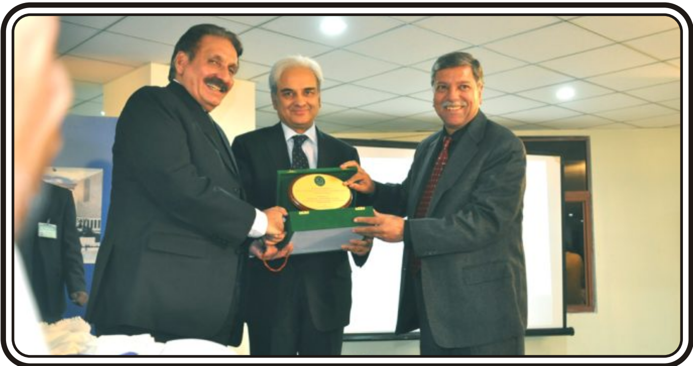
Honoring the honourable: Mr. Justice Iftikhar Muhammad Chaudhry, Chief Justice of Pakistan, presenting a shield to Hon'ble Mr. Justice Nasir-ul- Mulk, appreciating his valuable services as Judge Incharge, FJA during Golden Jubilee Celebrations of the Academy.