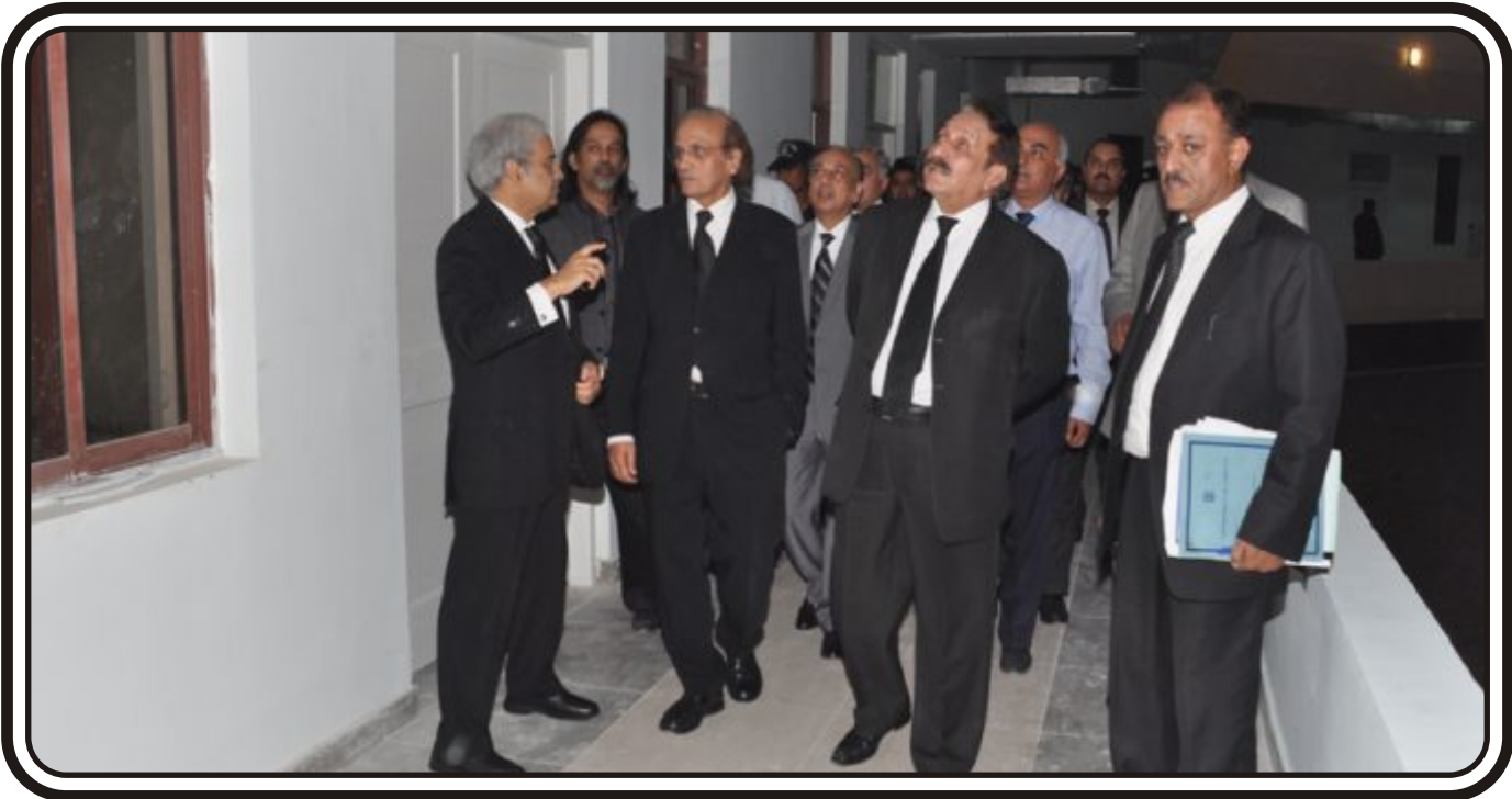
Today is a gift of God: Hon'ble (incumbent) Chief Justice of Pakistan exchanging ideas with Hon'ble two former Chief Justices of Pakistan during their visit to various parts of the newly constructed FJA-Phase -II building.