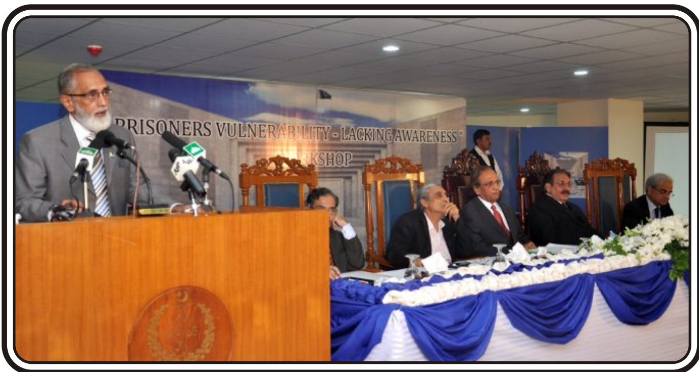
Hon'ble Mr. Justice Anwar Zaheer Jamali, Judge, Supreme Court of Pakistan, presenting his research paper in a two-day workshop on " Prisoners Vulnerability: Lacking Awareness" held at the CELJE/FJA, Islamabad.