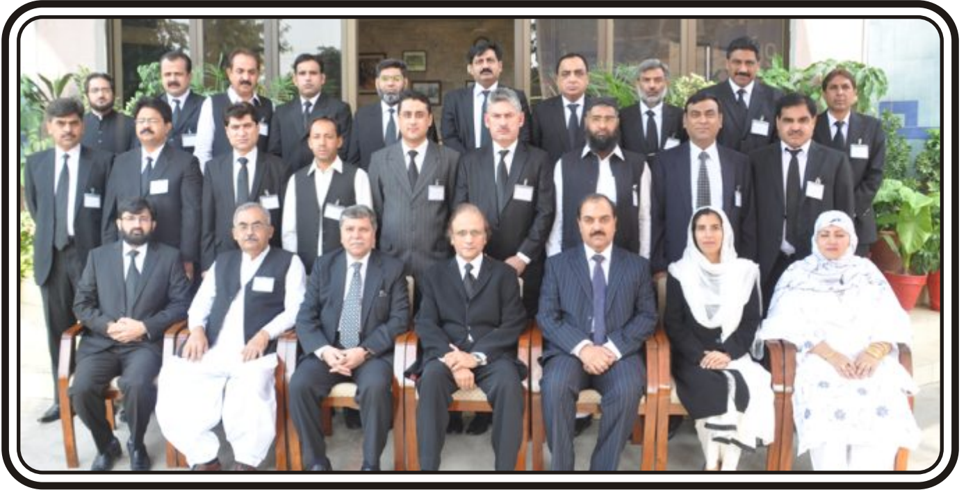
Trainee Judges from all over Pakistan in group photo with Mr. Justice Tassaduq Hussain Jillani, former Chief Justice of Pakistan and faculty members of the CELJE/FJA