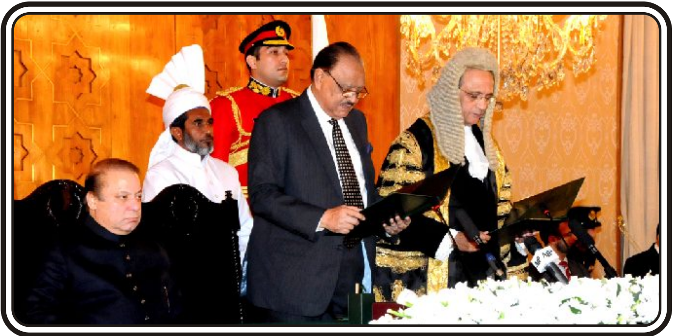
President Mamnoon Hussain administering oath of office to Hon'ble Mr. Justice Tassaduq Hussain Jilani as Chief Justice of Pakistan at a ceremony held at the Aiwan-e-Sadr, Islamabad on 12 December, 2013