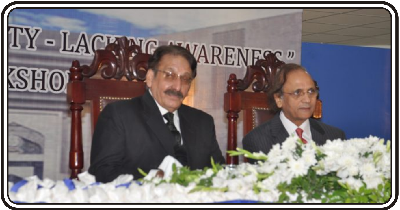
Yesterday is history: Hon'ble two former Chief Justices of Pakistan in a two-day workshop on " Prisoners Vulnerability: Lacking Awareness" under the auspices of Law and Justice Commission of Pakistan at to the CELJE/FJA, Islamabad.