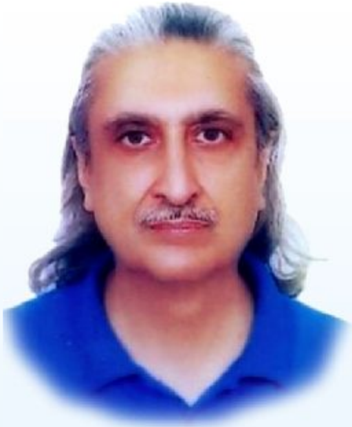
Hon'ble Mr. Justice Jawwad S. Khawaja

The Hon'ble Chief Justice of Pakistan/ Chairman, CELJE/ FJA, Board of Governors, has been pleased to constitute the following two-member Committee to assist his Lordship with regard to all affairs of the Centre of Excellence for Law and Judicial Education/ Federal Judicial Academy:-