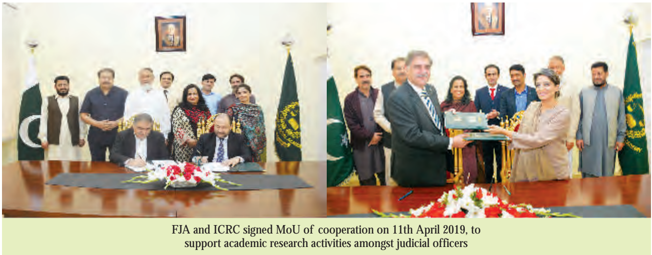
FJA and ICRC signed MoU of cooperation on 11th April 2019, to support academic research activities amongst judicial officers