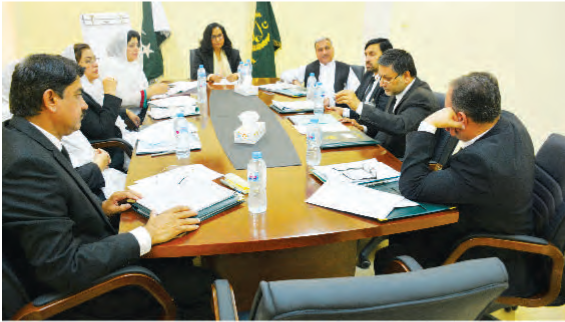
D&SJs involved in Syndicate discussions