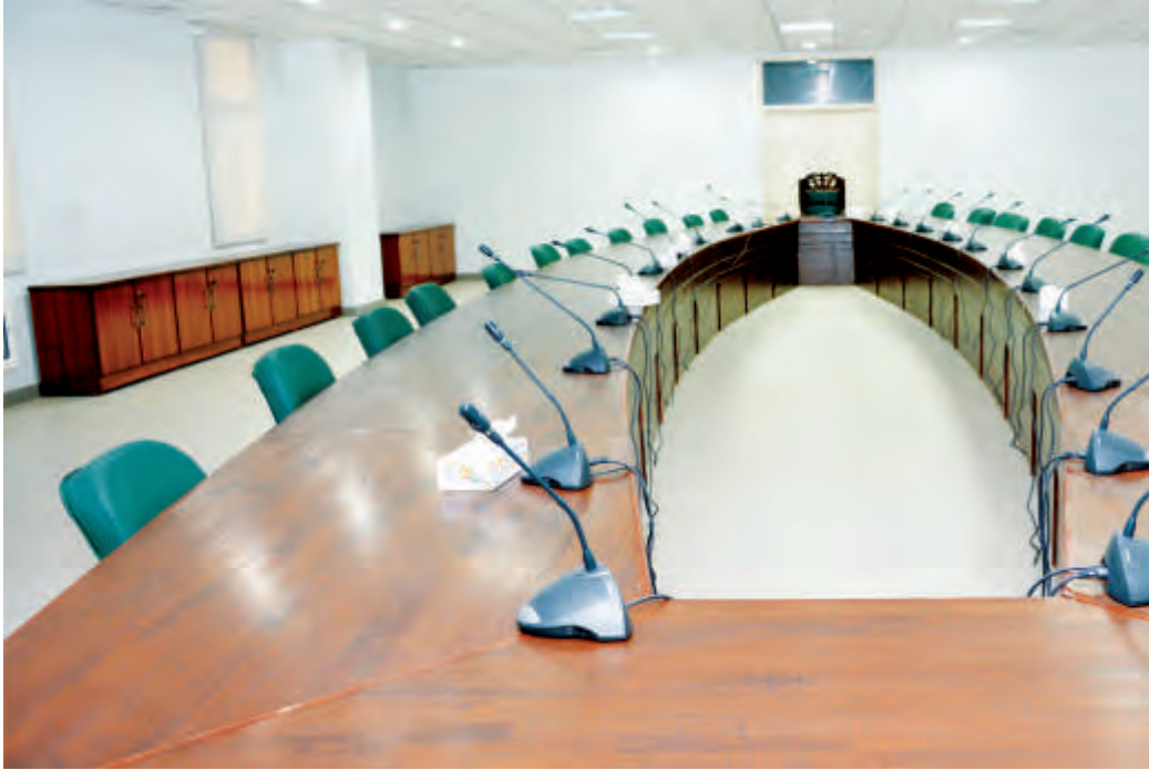
A huge Conference Hall with capacity to easily accommodate thirty five people around the table.