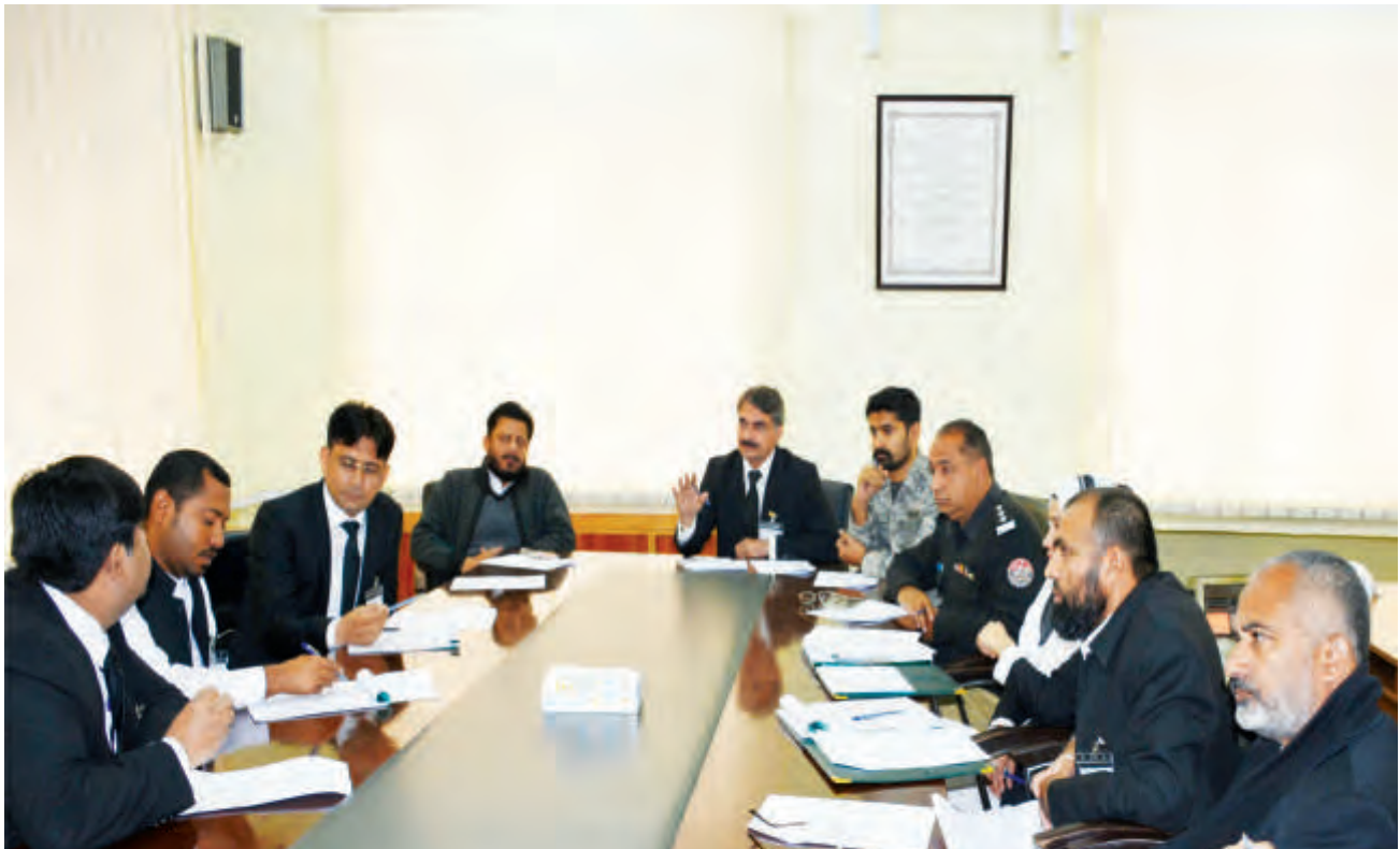
Prosecutors in a Syndicate discussion