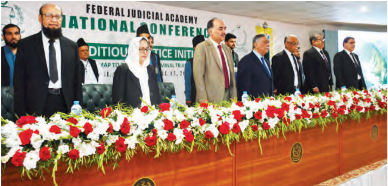
Hon'ble Chief Justice of Pakistan, along with Hon'ble Chief Justices of all the four provincial High Courts and Islamabad High Court at the launching ceremony of the EJI.