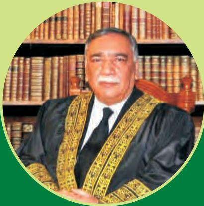
Mr. Justice Asif Saeed Khan Khosa

HONOURABLE CHIEF JUSTICE OF PAKISTAN/ CHAIRMAN BOARD OF GOVERNORS