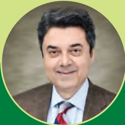
Barrister Dr. Mohammad Farogh Naseem

FEDERAL MINISTER FOR LAW & JUSTICE VICE-CHAIRMAN, BOARD OF GOVERNORS