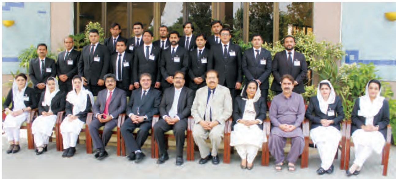
Participants with Raja Jawad Abbas Hassan, Registrar, Islamabad High Court and faculty members

TWO DAYS TRAINING WORKSHOP ON " INSTITUTION OF MAGISTRATE- CORNERSTONE OF CRIMINAL JUSTICE SYSTEM" FOR MAGISTRATES FROM ALL OVER PAKISTAN (SEPTEMBER 14 TO SEPTEMBER 15, 2018)