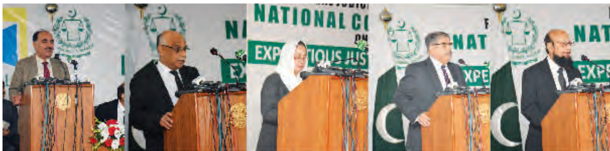
All the provincial Hon'ble Chief Justices committed to EJI while addressing the launching ceremony on 13th April, 2019