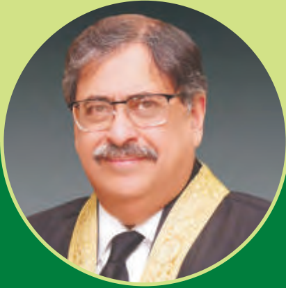
Mr. Justice Athar Minallah

HON'BLE CHIEF JUSTICE ISLAMABAD HIGH COURT MEMBER BOARD OF GOVERNORS