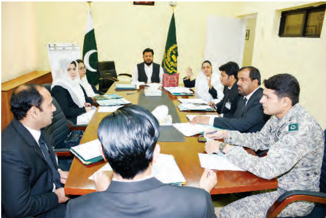
Civil Judges and participants from JAG Branch in Syndicate Discussions