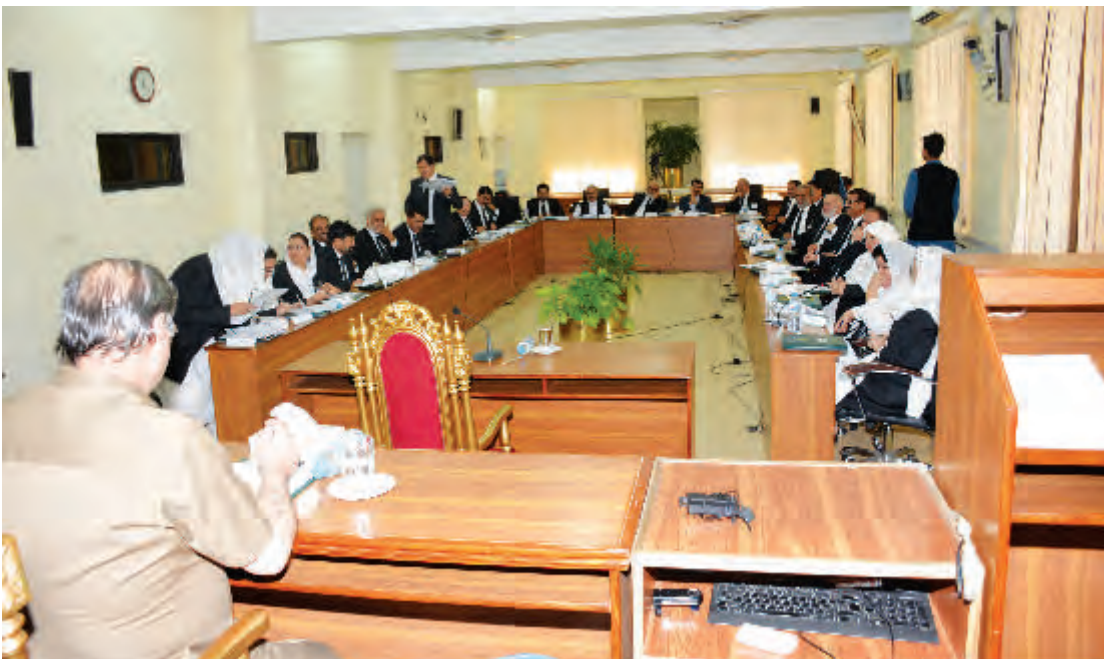
Study Circle, chaired by the Director General FJA, in process: