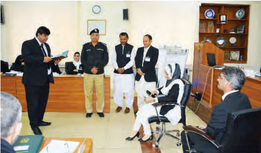
A group of participants applying their given Command Task