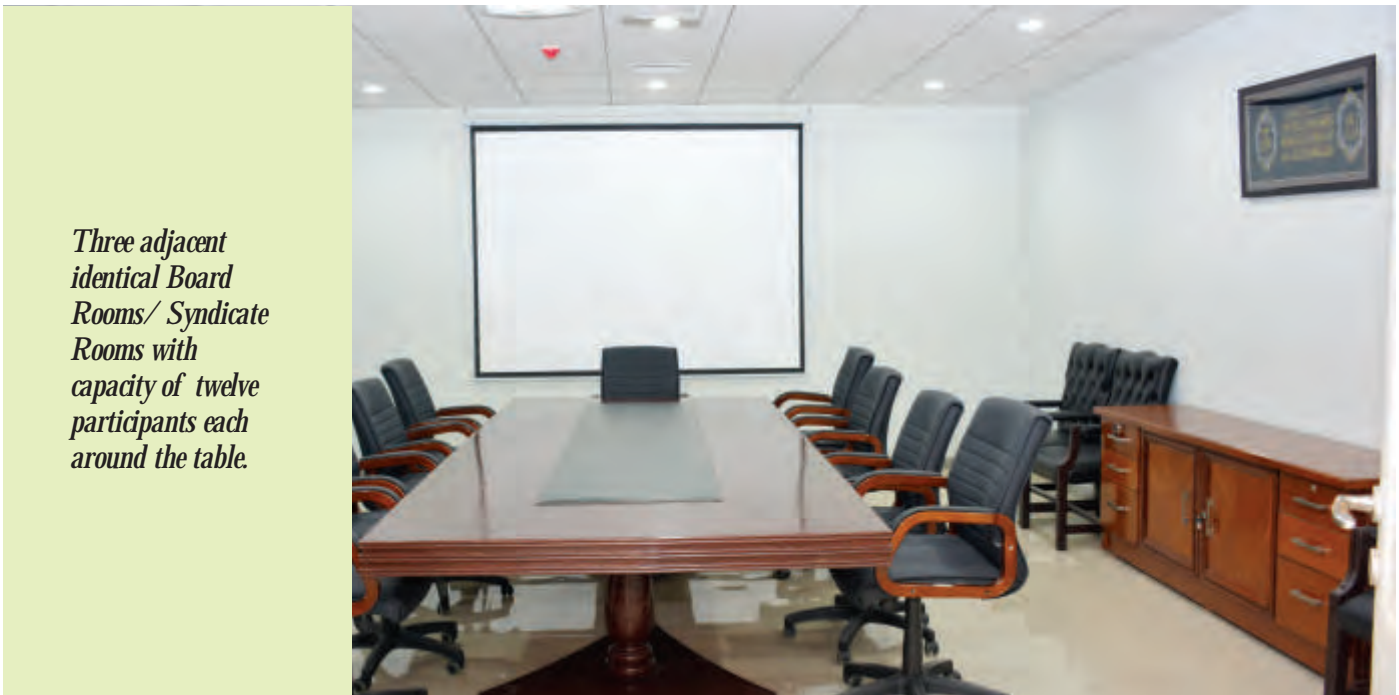
Three adjacent identical Board Rooms/ Syndicate Rooms with capacity of twelve participants each around the table.