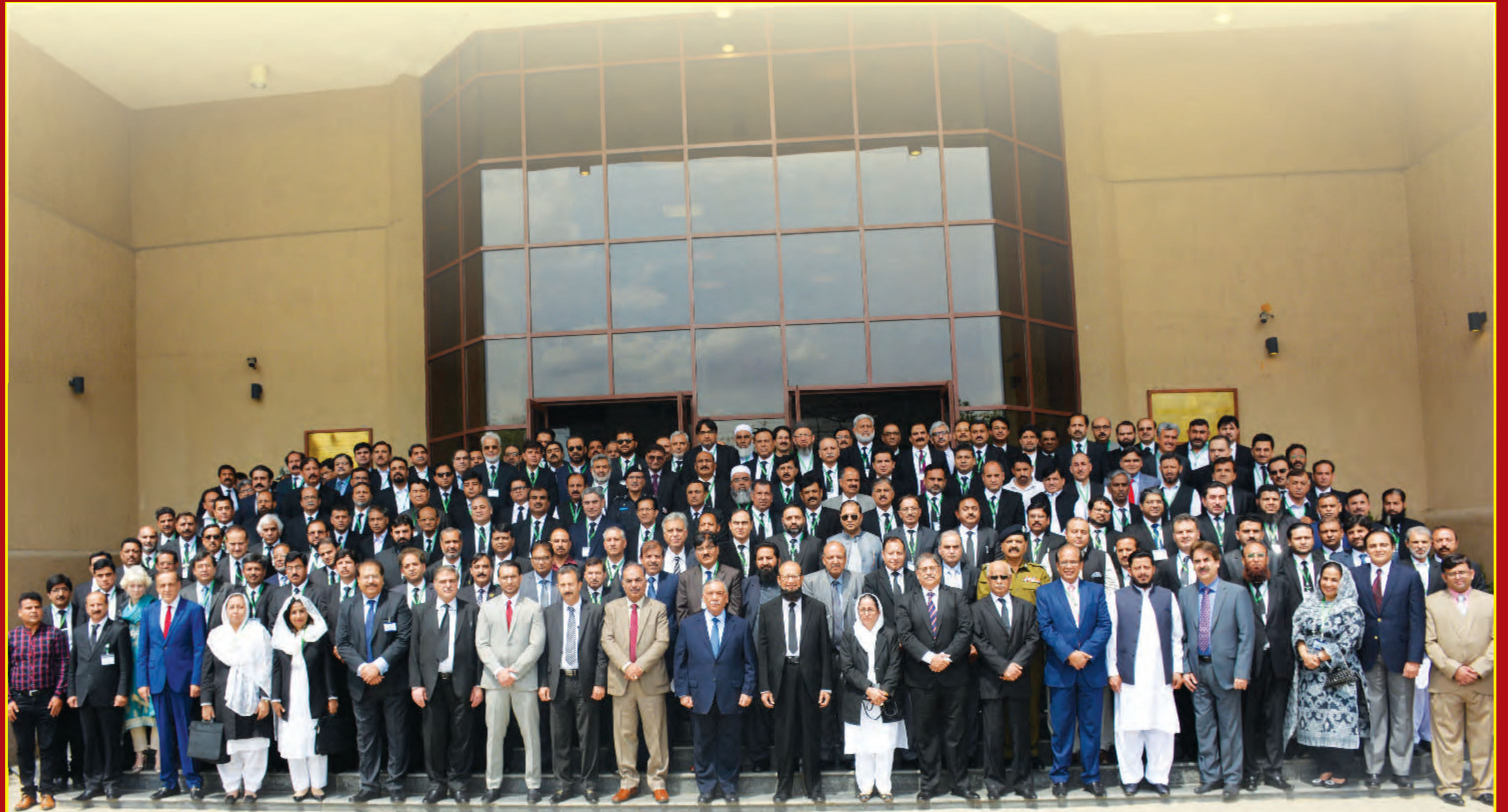
Hon'ble Chief Justice of Pakistan, Mr. Justice Asif Saeed Khan Khosa, at the launching of "Expeditious Justice Initiative" with Hon'ble Chief Justices of Islamabad & Provincial High Courts, District & Sessions Judges from across Pakistan, first batch of Judges of Model Criminal Trial Courts and faculty of Federal Judicial Academy, (Saturday 13 April, 2019)