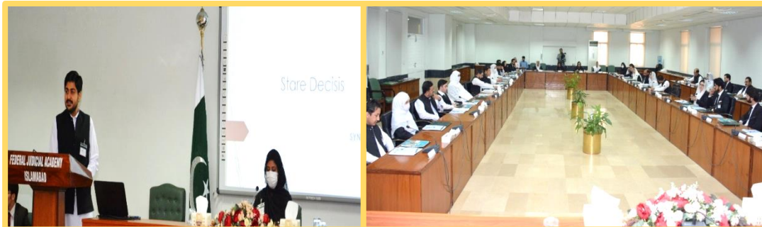
Participants in the Classroom