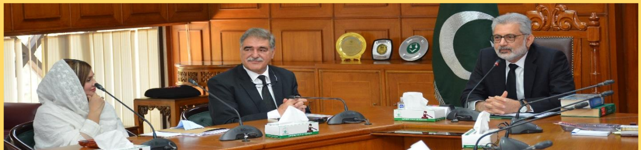
Hon'ble Mr. Justice Qazi Faez Isa interacting with FJA Faculty.

A batch of thirty six judicial officers from KP, under training in Federal Judicial Academy called on Justice Qazi Faiz Esa, Senior Puisne Judge, Supreme Court of Pakistan. In the hour long session their queries and concerns were very well received and responded by the Honourable Judge.