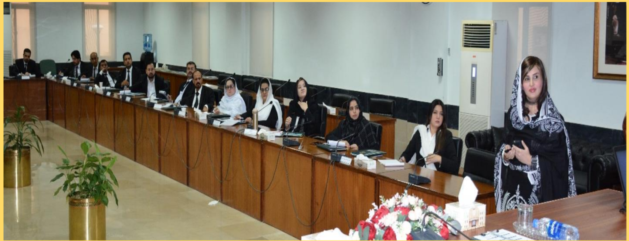
A faculty member in the Lecture Room