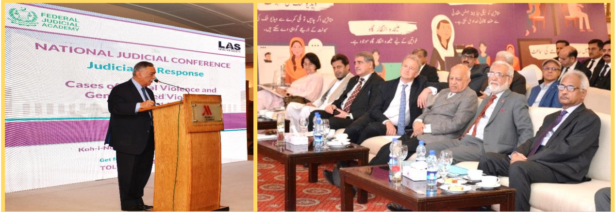
Chief Justice (R) Asif Saeed Khan Khosa, addressing the Conference as a Keynote Speaker

seminars on rights of women, should utilize their resources to provide legal aid to the affected women folk.