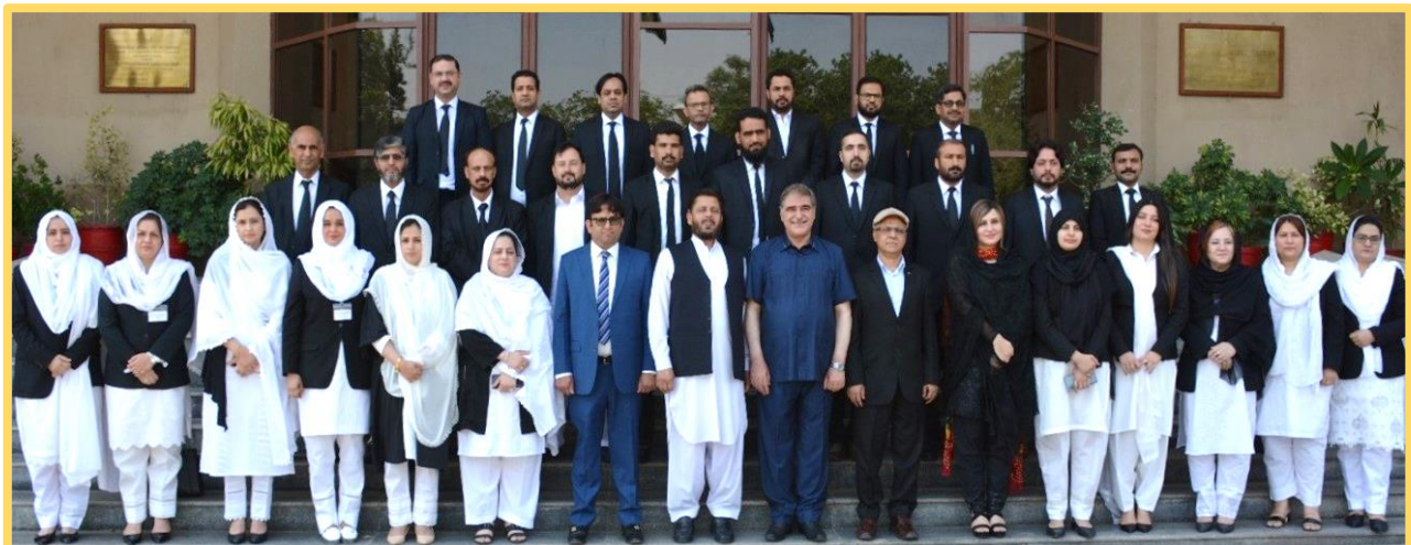
Judges in group photo with FJA Faculty members.