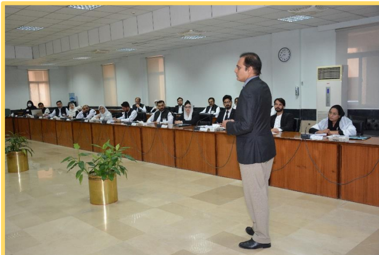
Addl. Director, FJA delivering Lecture

29 Senior Civil Judges/ Judicial Magistrates underwent the weeklong training course at the Academy.