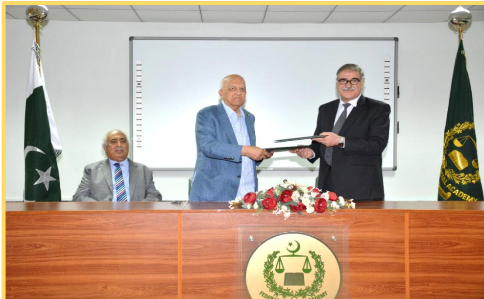
MOU signed between Federal Judicial Academy and Legal Aid Society-Pakistan