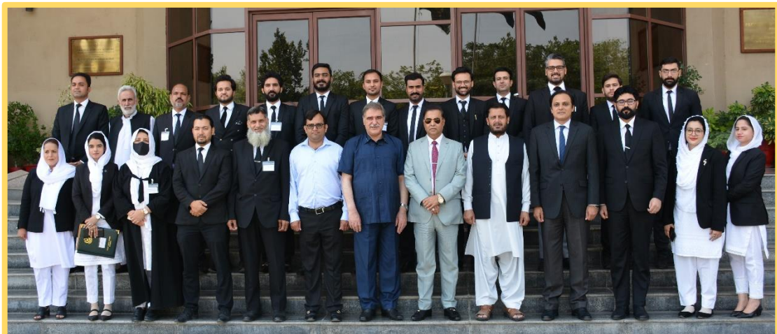
Participants of CLE Course with DG, Legal Aid and Justice Authority and FJA Faculty