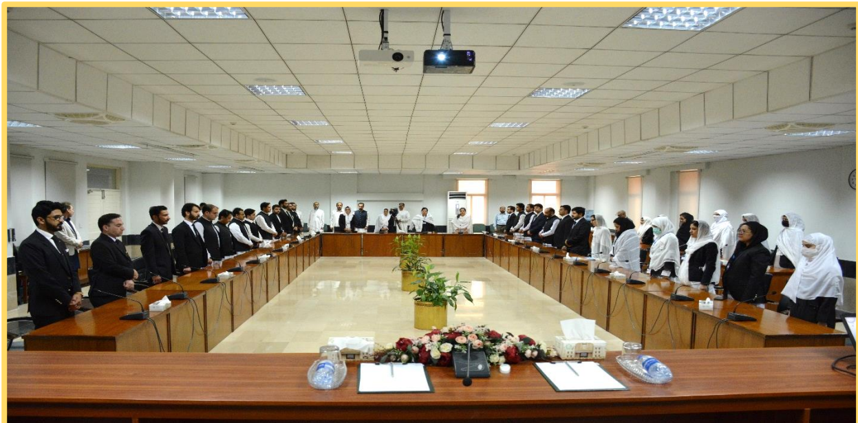
Judges from KP Judicial Academy led by DG, KP Judicial Academy in the lecture hall.

The Under Training Judicial Officers were given a presentation about the working of the Academy in the Lecture Hall.