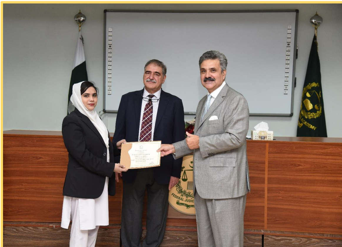
Hon'ble Mr. Justice Yahya Afridi awarding certificate to a lady participant