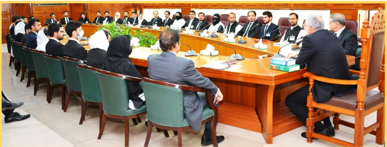
Hon'ble Mr. Justice Qazi Faez Isa interacting with trainee Judges at the Supreme Court of Pakistan.