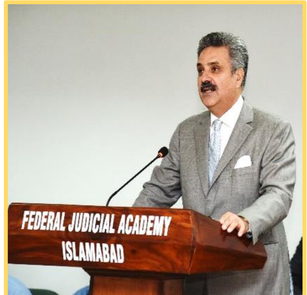
Hon’ble Mr. Justice Yahya Afridi at the concluding session

He concluded his address with a note, “Keep in mind that the career of a judge has to depend only on his professionalism, honesty, impeccable reputation and trust of society.”