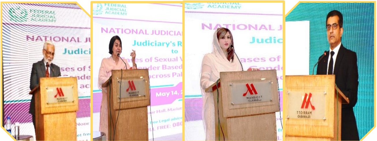
Speakers addressing the National Judicial Conference on “Judicial Response to Cases of Sexual and Gender Based Violence”.