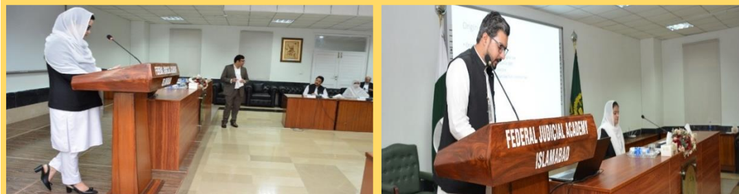
Participants in syndicate discussions, and presentations