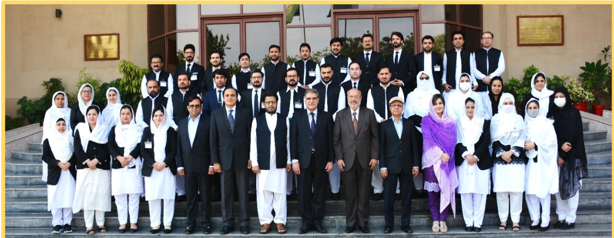
Participants of the course in group photo with Faculty members.

Advising the young judicial officers, he said, "Develop a passion for learning because learning and growth go together. Redress the grievances of the litigant public by providing them quality justice. Every wrongdoing is redressed by the justice".