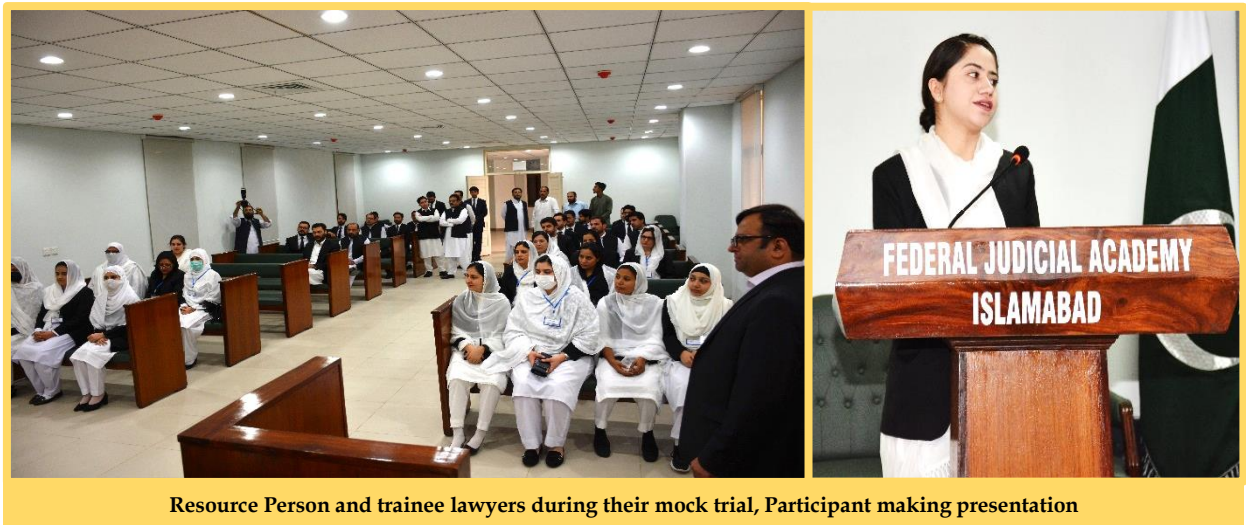
Resource Person and trainee lawyers during their mock trial, Participant making presentation