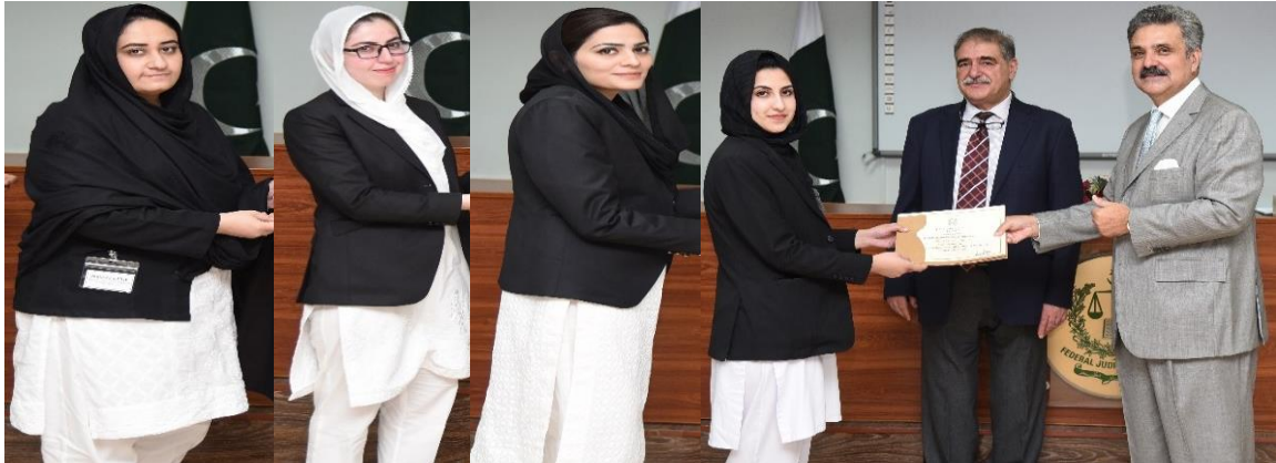
Trainee Judges receiving certificates