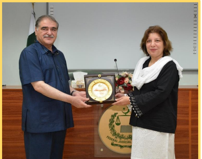
DG, FJA presenting mementos to DG, KPJA

The Under Training Judicial Officers were given a presentation about the working of the Academy in the Lecture Hall.