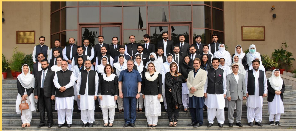
Judges from KP Judicial Academy led by DG, KP Judicial Academy in group photo with FJA Faculty members.

While addressing the UT Judicial Officers, DG advised young judicial officers to strive for acquiring an expertise on law so as to deliver the quality justice to the litigants. The delegation was given the visit of various sections of the Academy. Later, the memorial shields were also exchanged.