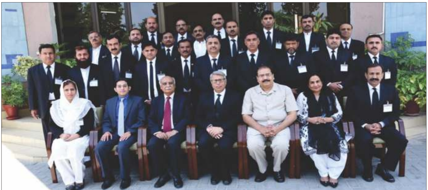
Law Officers in group photo with the chief guest and faculty members.

Twenty-three District Attorneys/ Deputy District Attorneys including two Advocates General from all over Pakistan, Gilgit-Baltistan who benefited from this one week training course at the Academy, were awarded certificates in the ceremony.