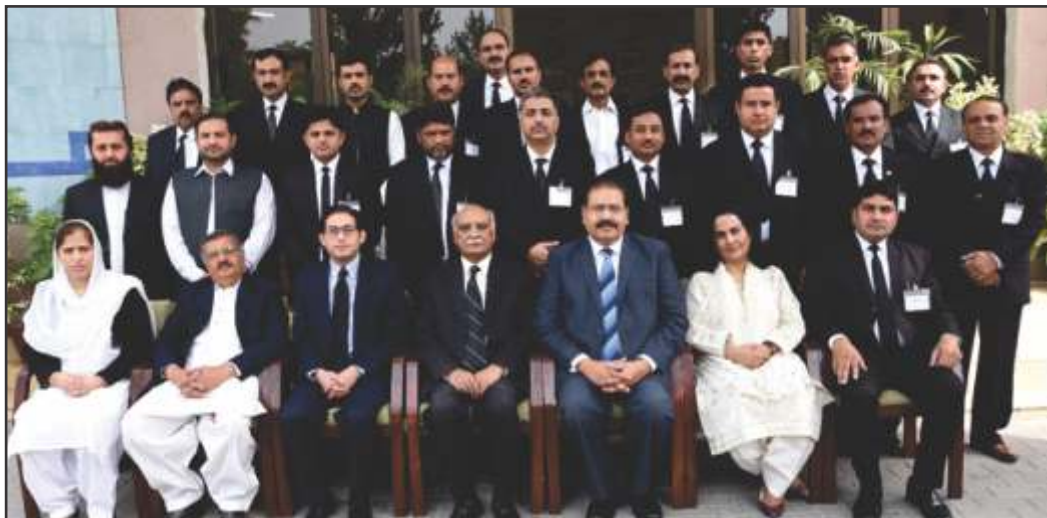
District and Deputy District Attorneys in group photo with faculty members.

Welcoming and sensitizing the participants about the importance and scope of trainings at the FJA, he maintained, “In-service training is