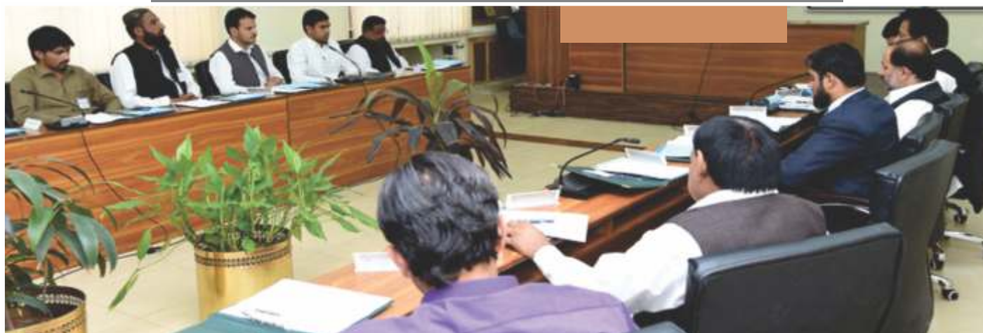
Nazirs/ Budget and Accounts Examiners in the inaugural ceremony.

Twenty-five Nazirs/ Budget and Accounts Examiners were nominated to attend this weeklong training in the Academy.