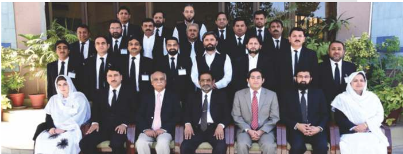
Senior Civil Judges in group photo with the DG, Balochistan Judicial Academy and faculty members.

and an overview of the training course. Twenty-six Senior Civil Judges were awarded certificates in the ceremony.