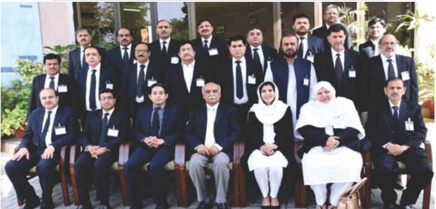
Newly promoted District and Sessions Judges posing for group photo with faculty members.

Twenty-six newly promoted District and Sessions Judges underwent this weeklong training at the Academy.