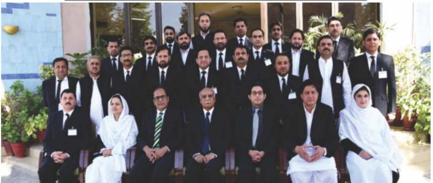
Senior Civil Judges in group photo with faculty members and the learned resource person.