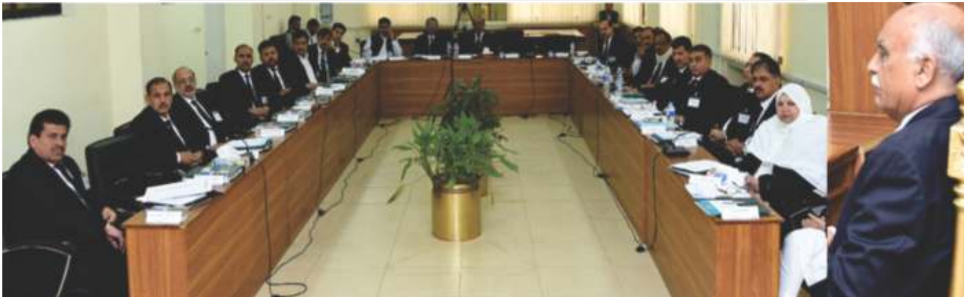
DG, FJA, addressing the newly promoted District and Sessions Judges in the inaugural ceremony.

He said, "This is a pragmatically conceptualized and conceived course, covering each and every topic, for effective management and administration. The over-arching goal of this training course is to build an understanding of the financial management, you will have opportunity to learn the all facets of Financial Management. I personally believe that ignorance in Financial Management and also in New Laws and emerging trends and skills would invite serious trouble for the effective functioning of