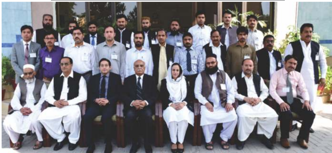
Nazirs/ Budget and Accounts Examiners in group photo with faculty members.