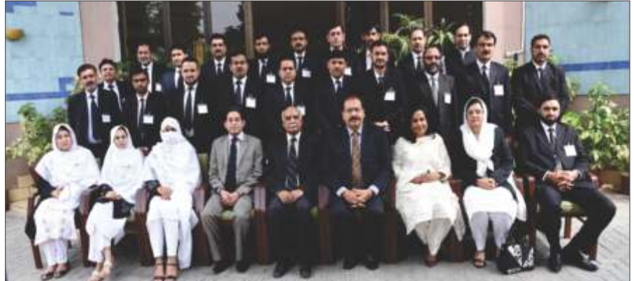
Civil Judges-cum-Magistrates in group photo with faculty members.

“There are tremendous benefits from this like training. All of you just try to reap those benefits with your active participation and perform better in your courts by putting in use the gained knowledge and skills.