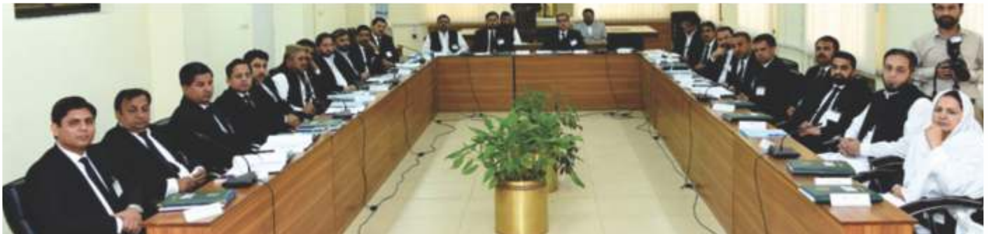
Senior Civil Judges in the inaugural ceremony of a one-week training course.

He said, “The Academy always devises, organises and conducts continuing professional development training courses as per its Annual Judicial Education Course Calendar For each stakeholder of the administration of justice system with a view to broadening the knowledge of judicial officers, law officers, attorneys, court personnel, keeping them abreast of developments in the law, encouraging them to share experiences and Enhancing their professional skills. Apart from the faculty, the Academy always invites judges both serving and retired, members of the legal profession, experts, academia, among others, to impart trainings. In this training we have also invited a variety of erudite resource person to share their knowledge and wisdom with you on new laws, and other related topics. I hope that this training will be highly productive for you.”