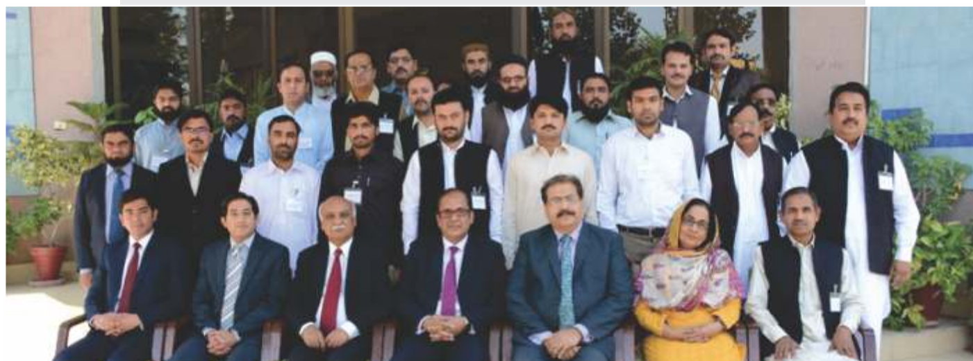
Nazirs/Budget and Accounts Examiners in group photo with the chief guest and faculty members.