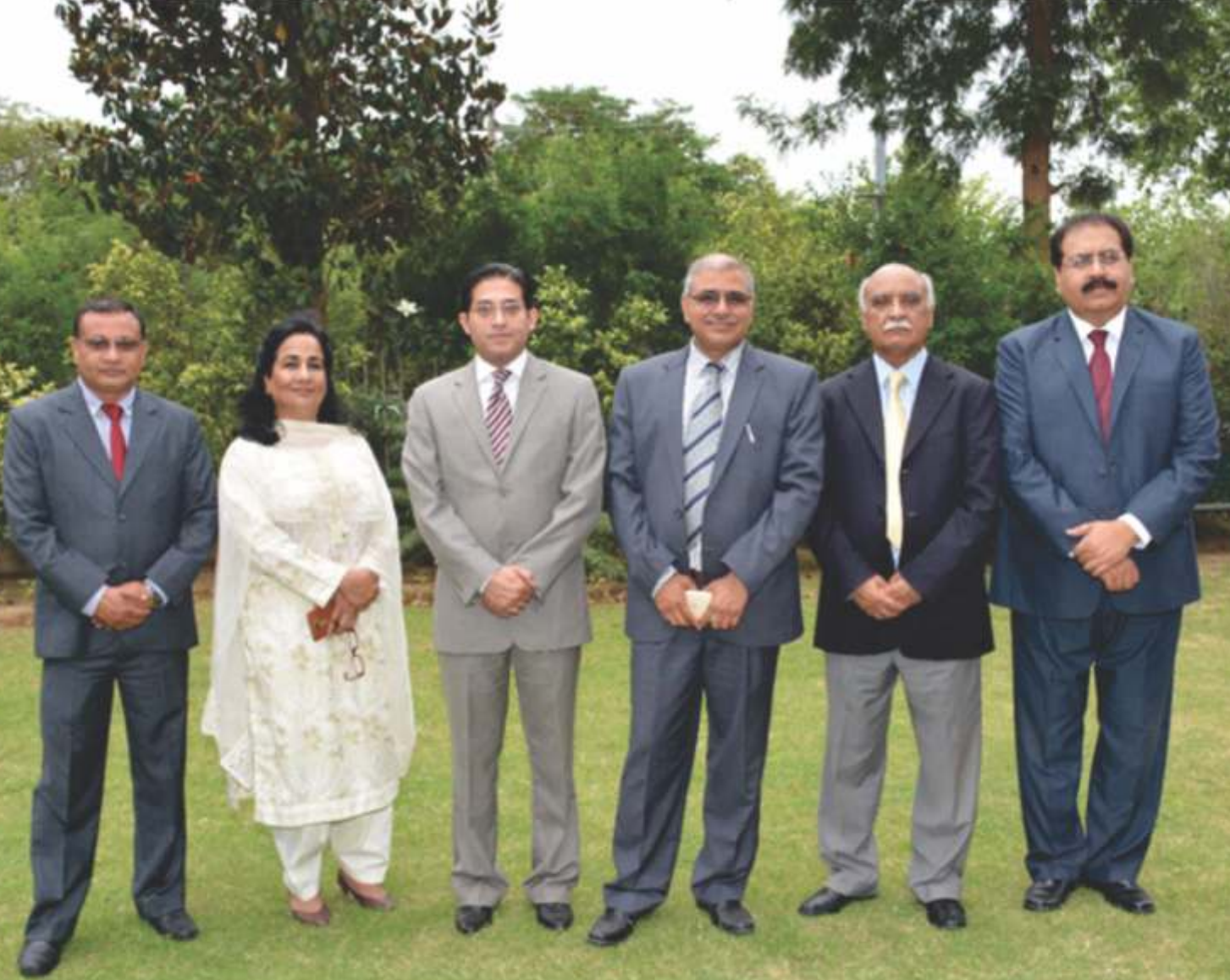
A two-member Nepali delegation in group photo with the faculty members on May 15, 2017 at the Academy.

The Editor, Federal Judicial Academy, Service Road South, H-8/4 Islamabad, Pakistan Ph: 051- 9269072, Fax: 051 -9269688, Email: editor@fja.gov.pk This Bulletin is hosted on the FJA website: http://www.fja.gov.pk/