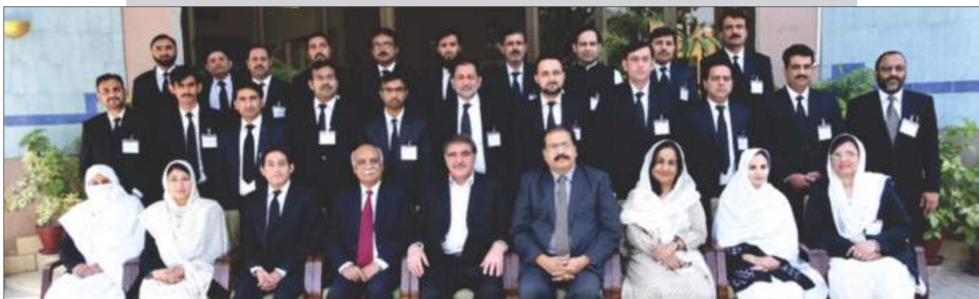
Participants in group photo with the chief guest and faculty members.

Twenty-five Civil Judges cum-Magistrates were awarded certificates in the ceremony at the Academy.