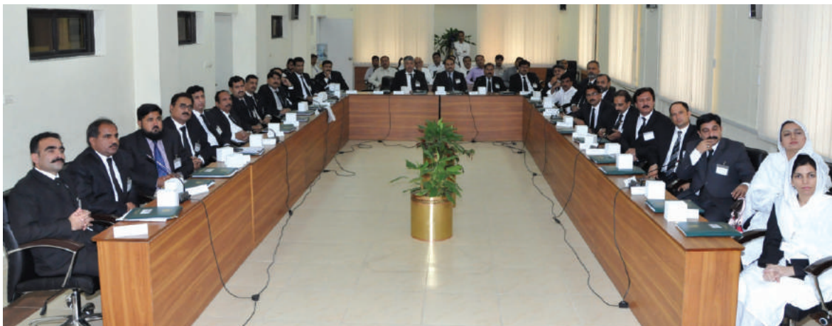
We Are Ready To Learn: Prosecutors in the certificate awarding ceremony.