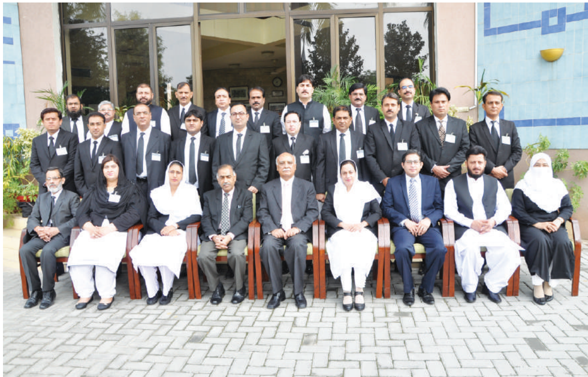
We Can Frame A Moment. But We Can't Frame Life: Additional District and Sessions Judges in group photo with Faculty members.

judges and other key players of the system to have a careful understanding of the existing and new laws, growing skills and emerging trends in the system. The training is always extremely helpful in understating of many things.”