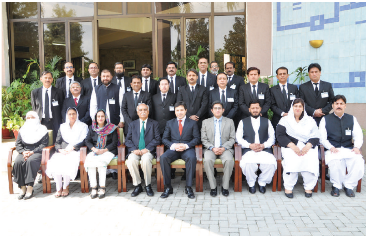
Capture A Moment: Additional District and Sessions Judges in group photo with the honourable Chief Guest and Faculty members.