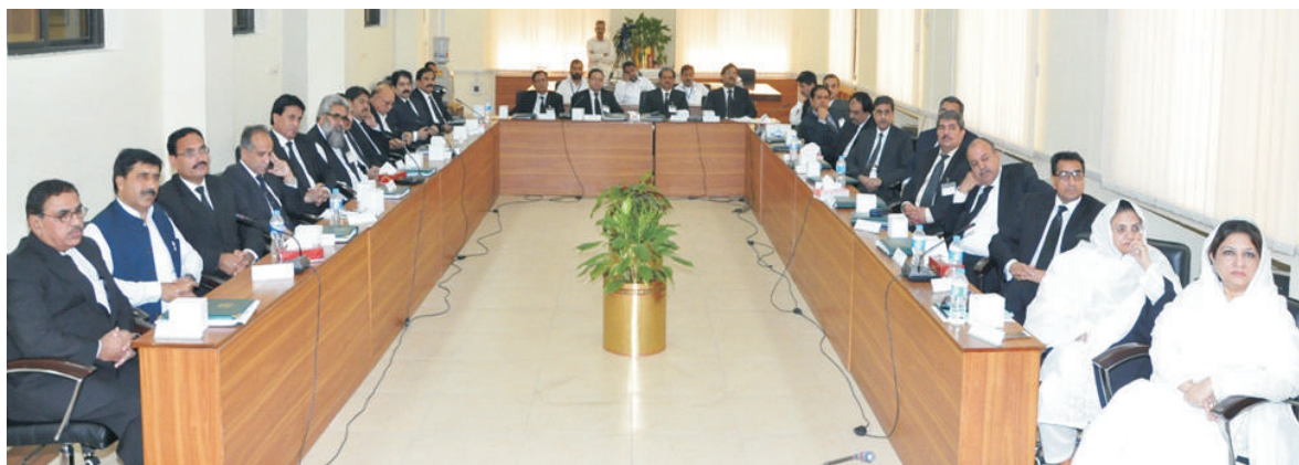
The Efficacy of Training: District and Sessions Judges in the certificate awarding ceremony.