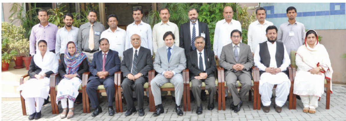
If Everyone Gets a Second Chance: Participants of a three-day Capacity Building for the Establishment of Consumer Protection Court, Charsadda and Staff of the Academy in group photo with the honourable Chief Guest and FJA Faculty members.