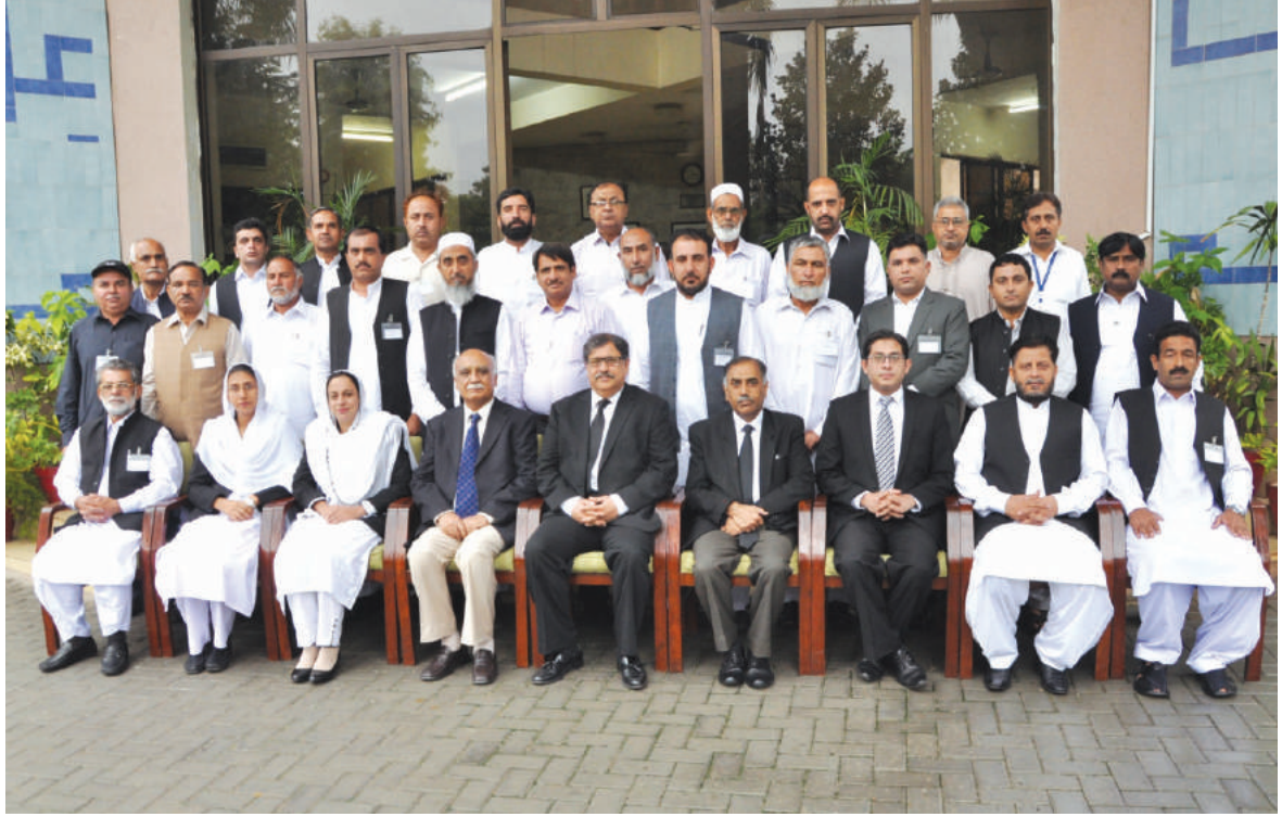
When We Are In Training, a Group Photo Is A Must: Superintendents of Sessions Courts in group photo with the honourable Chief Guest and FJA Faculty members.

هر روز دلم به زیربازی دگر است در دیده من ز هجر خاری دگر است من جهد همی کنم قضا می گوید بیرون ز کفایت تو کاری دگر است