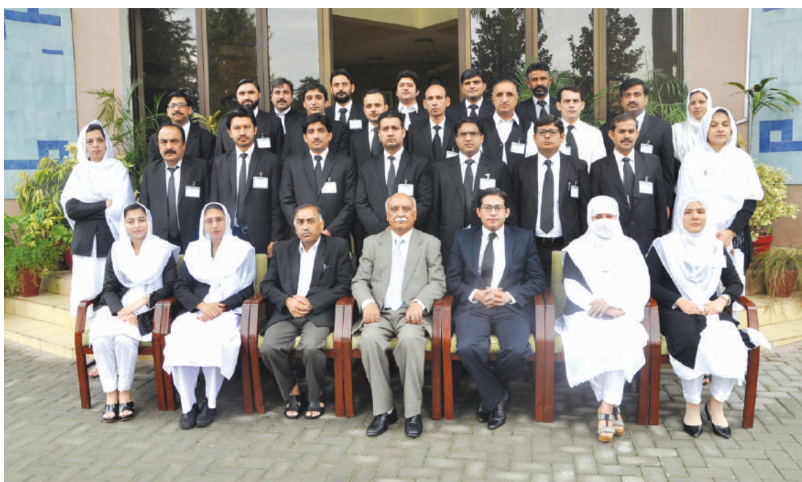
A Photograph is a Reality: Participants of capacity building course in group photo with DG and other faculty members.

Twenty-six participants-out of them seven females-underwent this training at the Academy.