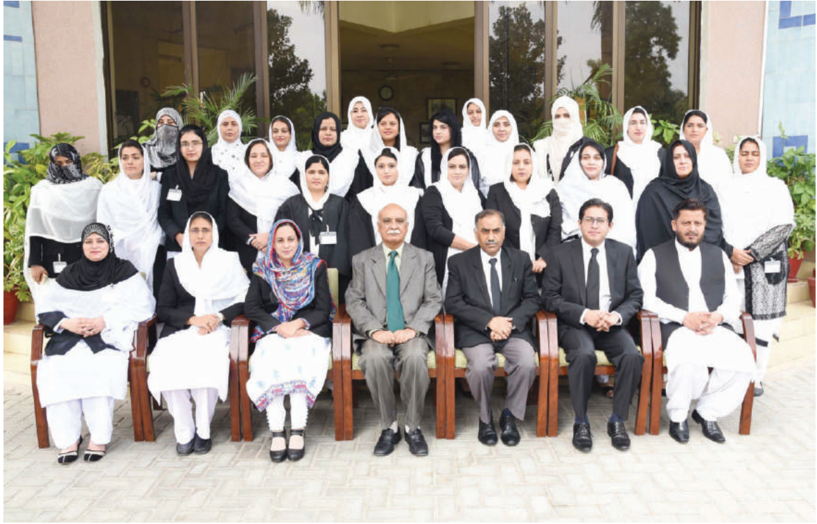
How Transient Is Life! Family Court Judges in group photo with Faculty members.