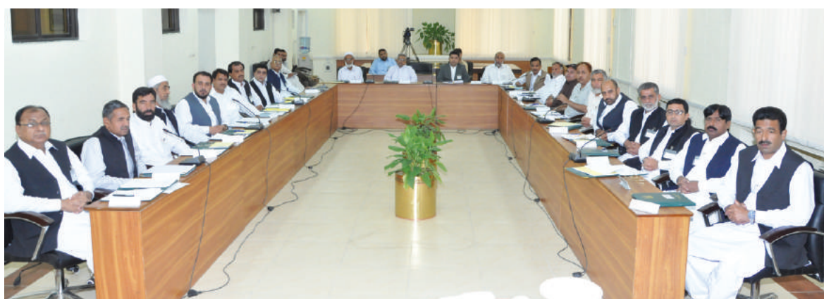
Learning Is A Treasure: DG addressing Superintendents of Sessions Courts in the inaugural ceremony.

Twenty-four Superintendents of Sessions Courts from all over Pakistan, Azad Jammu and Kashmir and Gilgit-Baltistan benefited from this weeklong training at the Academy.