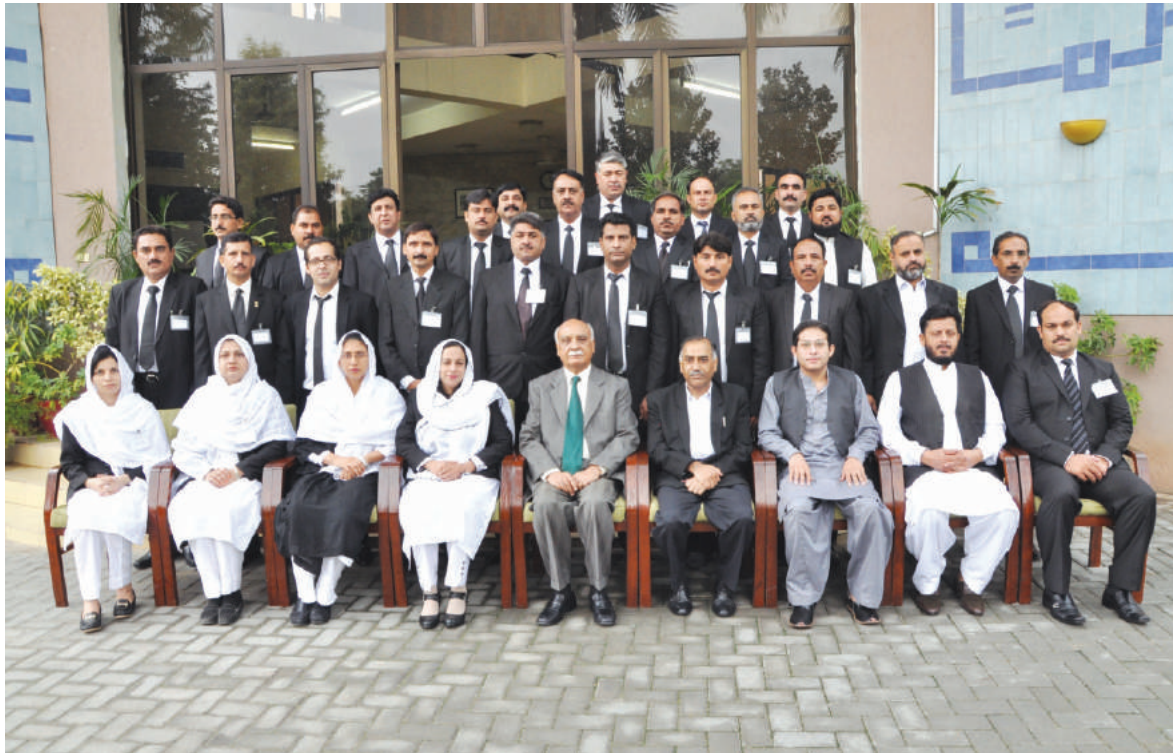
A Picture Is A Secret About A Secret: Prosecutors in group photo with Faculty members.

types of serious and heinous crimes and this type of training contributes to the effective functioning of the prosecutors to enhance their dignity and combat corruption like menace from the society. That's why, in this training we have also Prosecutors of the NAB sitting beside you people to sharpen their skills for prompt and effective prosecution of fiscal and other crimes in the Accountability Court and other courts.”