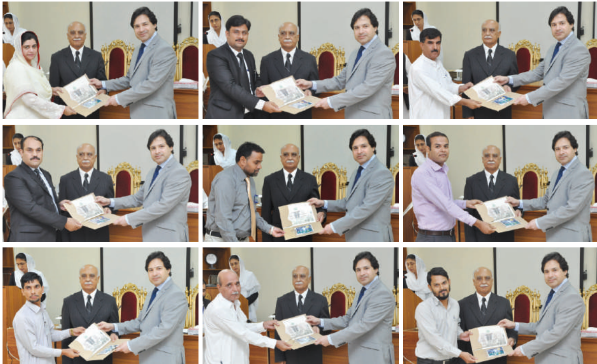
The Highest Reward For Man's Toil Is Not What He Gets For It, But What He Becomes By It: Participants of two different capacity building courses being awarded certificates in the certificate awarding ceremony.