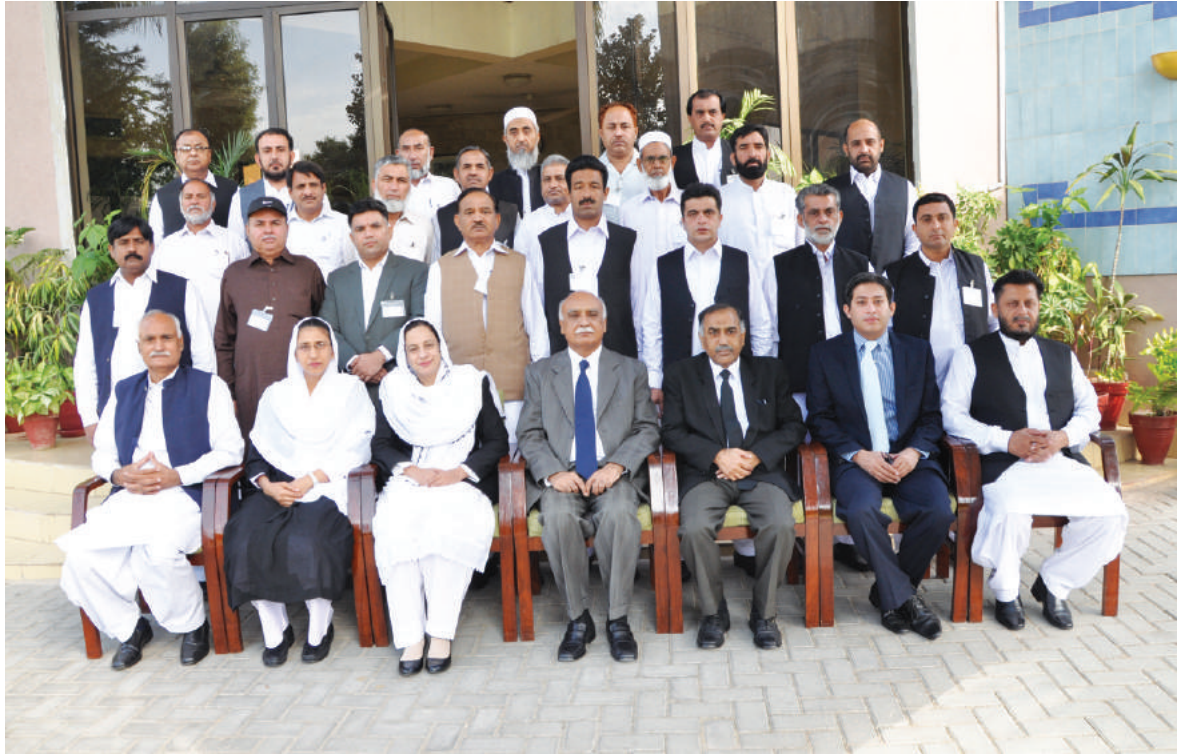
So This Is For Us: Superintendents of Sessions Courts posing for group photo with DG and other Faculty members.