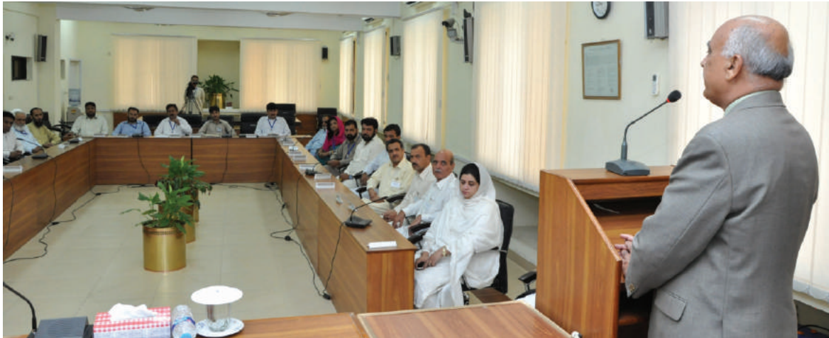
We have a passion for learning: DG addressing participants of capacity building course.

DG was appreciative of all those who were instrumental in bringing this capacity building training to fruition. Ten participants were nominated both from the Establishment of Consumer Protection Court, Charsada and Federal Judicial Academy to benefit from this three day capacity building training.