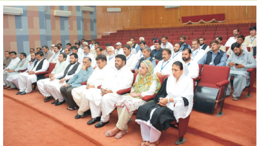
Celebrating Teamwork: FJA Faculty, Officers and Staff members in the auditorium.

In the end, souvenirs were distributed in this simple but impressive ceremony.