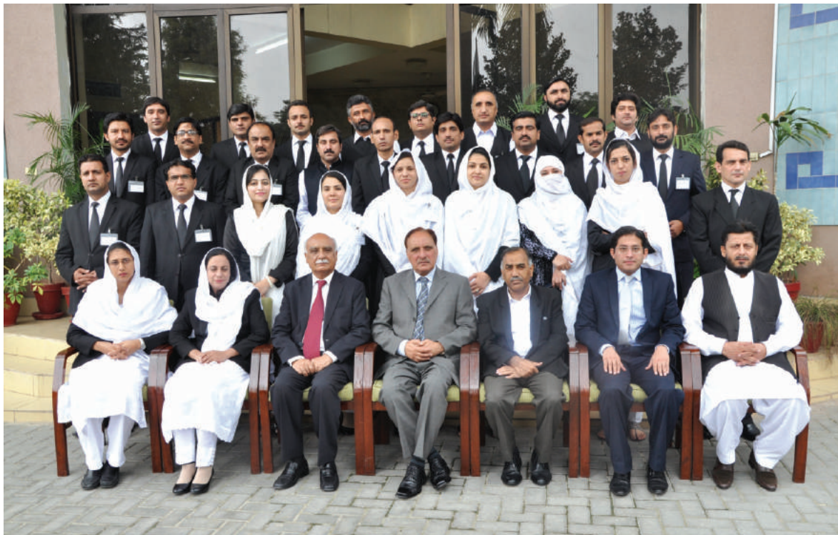
We Are Never Alone: Civil Judges-cum- Magistrates in group photo with the honourable Chief Guest.