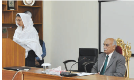
DG sitting on the stage and Additional Director on the dais during ceremony.

He said, “We all know that prosecution is an important component of our criminal justice system. It is the duty of the State to prosecute cases in the courts of law. We have different cadres of prosecutors to prosecute cases at various levels within the criminal justice system. In today's society, we have different