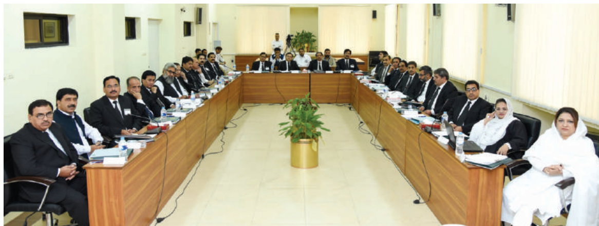
All Know the Way, But Few Actually Walk It: District and Sessions Judges in the inaugural ceremony.

purpose, we invite the professional judicial educators, subject experts, not only from the judiciary and legal profession but also from other related fields. Inexpensive and expeditious dispensation of quality justice demands that the stakeholders of the administration of justice system to be well-equipped with the requisite tools in order to dispense justice.”