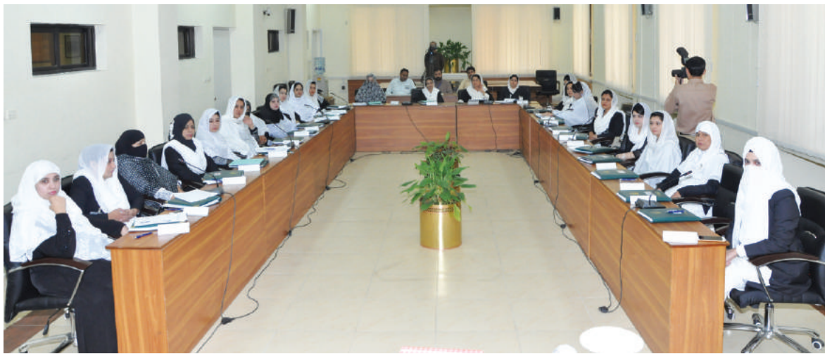
Searching and Learning is where the miracle process all begins: DG addressing Female Judges of the Family Courts in the inaugural ceremony.

training course on “Management of Family Cases” for Female Judges of the Family Courts from all over Pakistan and Azad Jammu and Kashmir and Gilgit-Baltistan at the Federal Judicial Academy, on September 19, 2016.