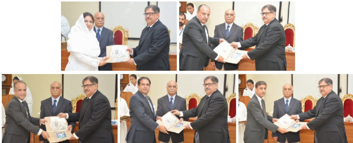
And This Is Recognition: District and Sessions Judges receiving certificates from the honourable Chief Guest.