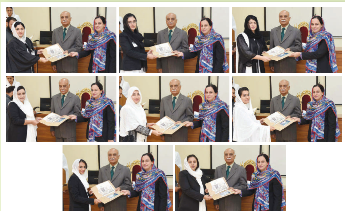
You Will See Me: Family Court Judges receiving certificates in the ceremony.

Twenty-six Female Family Court Judges from all over Pakistan, Azad Jammu and Kashmir and Gilgit-Baltistan were awarded certificates in the ceremony.