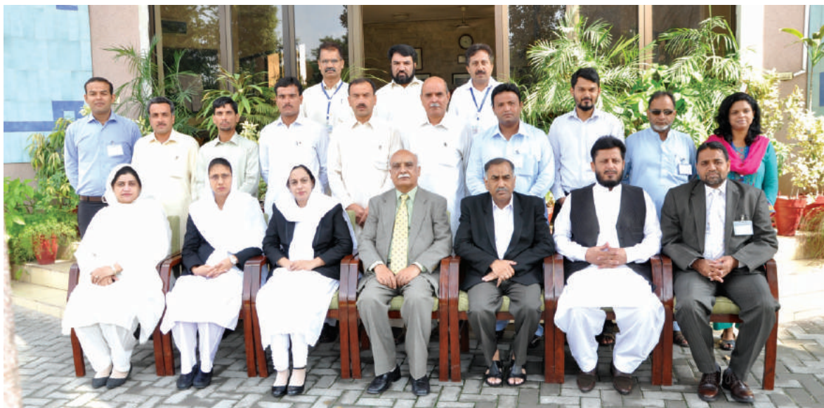
In The Eye of Camera: Participants of capacity building course in group photo with Faculty members