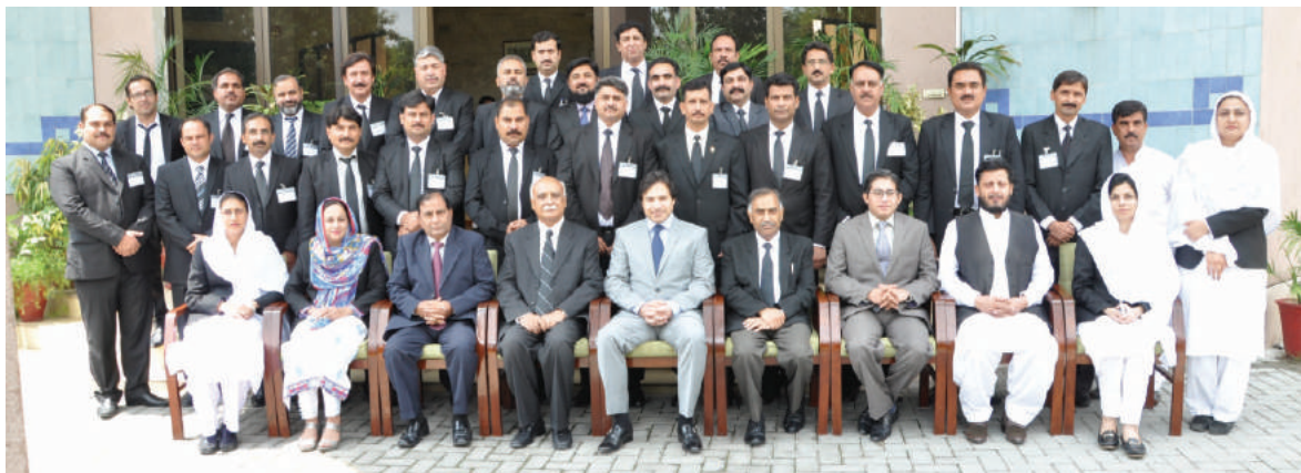
Promise Me We'll Meet Again: Prosecutors in group photo with the honourable Chief Guest and FJA Faculty members.