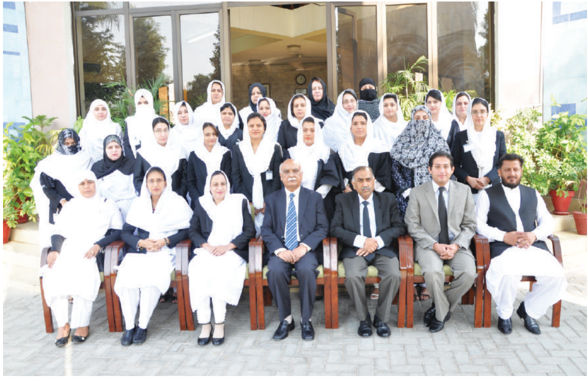
All Photographs Are Memento: Female Judges of the Family Courts in group photo with Faculty members.