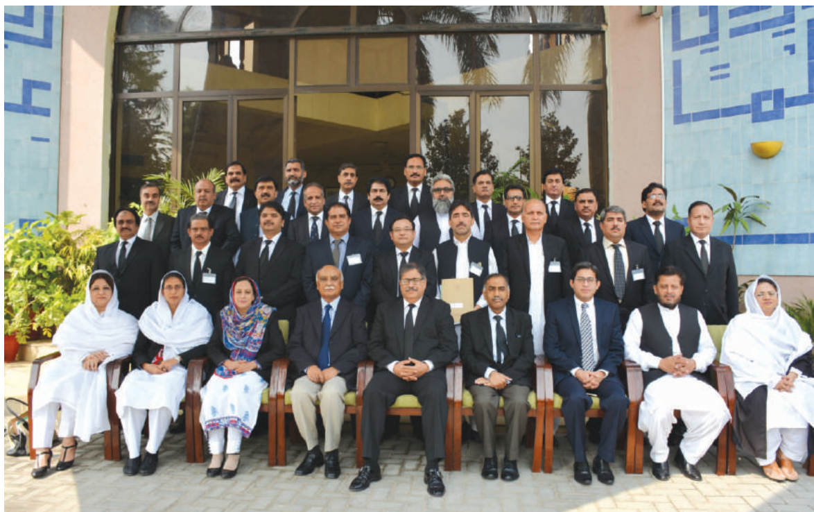
Exhibiting Strong Professional Cohesion: District and Sessions Judges in group photo with the honourable Chief Guest.

participants to put in practice the knowledge, methods and tools to improve the quality of justice in the district judiciary.