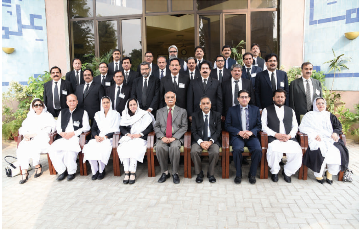
Seeing The Truth: District and Sessions Judges in group photo with the Faculty members.