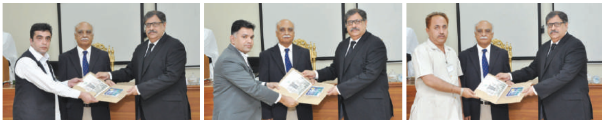
The Fruit of Learning: Superintendents of Sessions Courts being awarded certificates in the certificate awarding ceremony.

Twenty-four Superintendents of Sessions Courts from all over Pakistan, Azad Jammu and Kashmir and Gilgit-Baltistan were awarded certificates in the ceremony at the Academy.