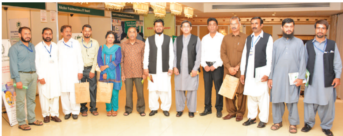
We Love Learning: FJA Faculty and staff members in group photo on the occasion of use of Information Technology in Justice Sector Exhibition and Seminar.

Speaking on the occasion, Chief Justice Lahore High Court Hon'ble Mr. Justice Mansoor Ali Shah said that in order to monitor and expedite the hearing of cases, it was imperative that judicial officers and judges should get expertise in IT knowledge and its implementation.