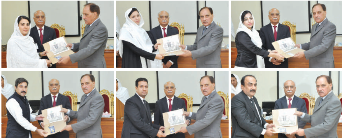
A Reward Opens the Way: Civil Judges-cum- Magistrates being awarded certificates in the certificate awarding ceremony.

Twenty-six participants-out of them seven females- who benefited from this training, were given certificates in the ceremony at the Academy.