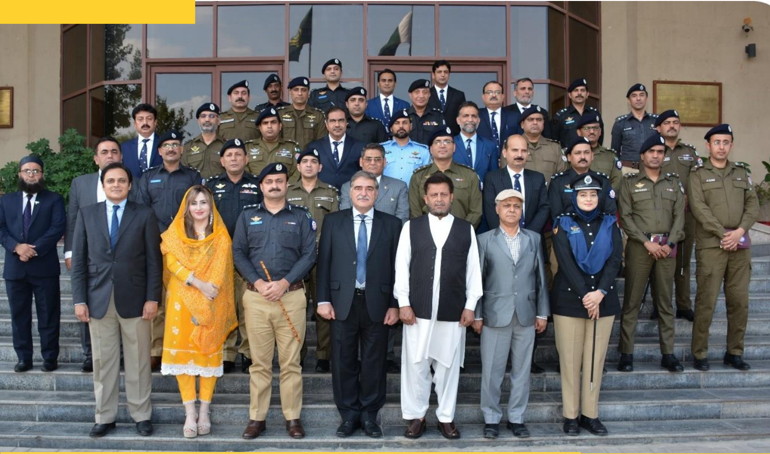
Police officers of 36 th MCMC in a group photo with DG, FJA and Faculty Members