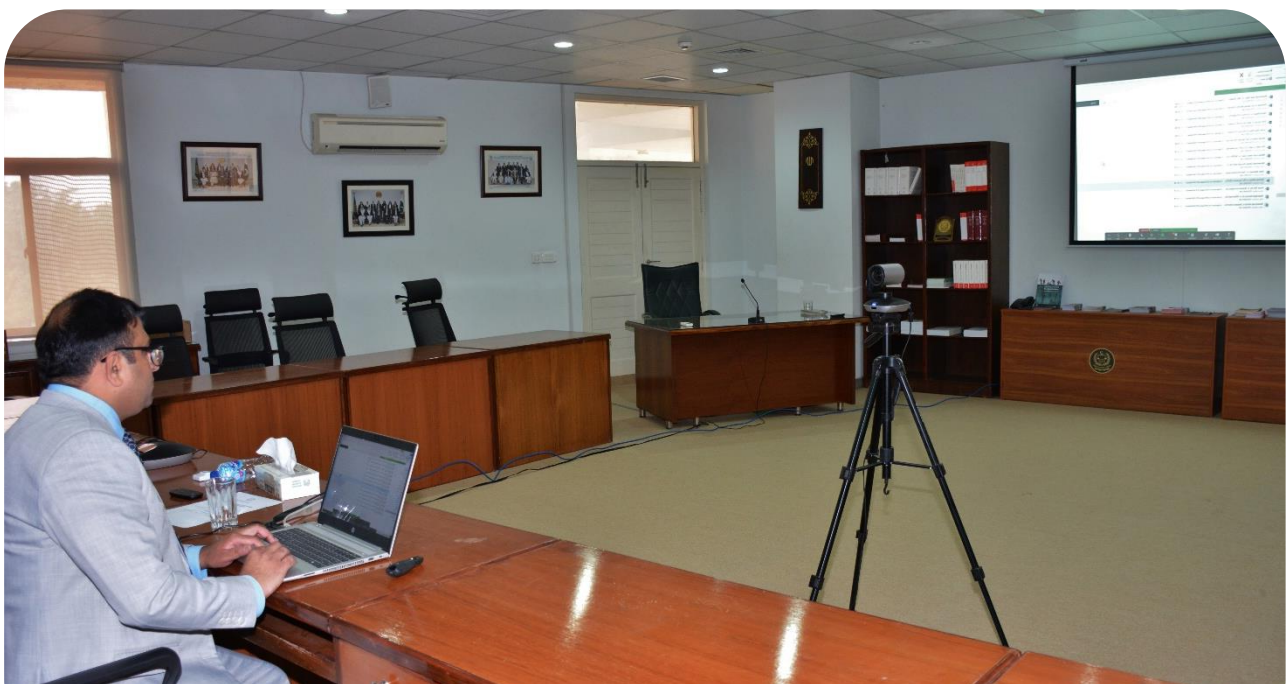
Deputy Director, FJA conducting webinar on “Use of IT in Justice Sector”

Through interactive discussions and practical examples, the webinar provided the participants with valuable knowledge and resources to harness the power of technology in their daily work. By promoting the use of IT in the justice sector, the FJA's webinar tried to assist in accelerating the adoption of digital solutions, streamlining court operations, and ultimately enhancing access to justice for all citizens of Pakistan.