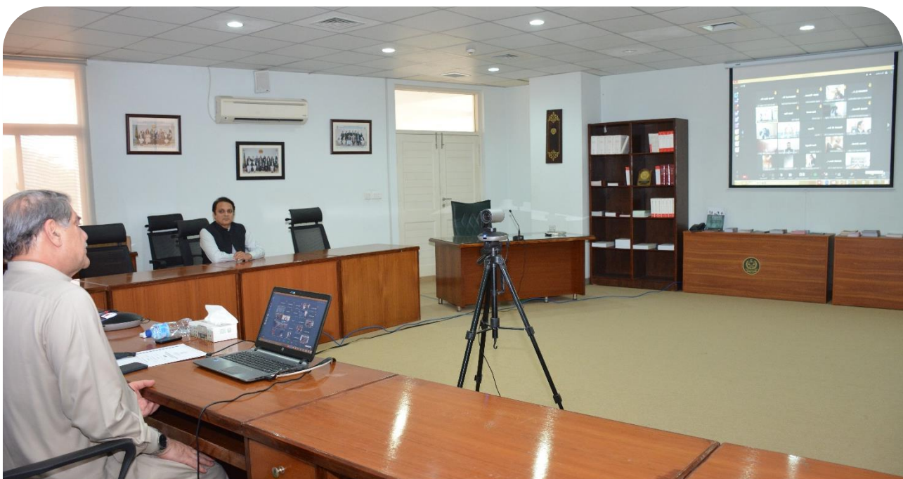
DG, FJA delivering an open address on a webinar on “ADR-The Way Forward”

This FJA's webinar aimed to pave the way forward for the adoption and integration of ADR practices in the judicial system of Pakistan, ultimately enhancing access to justice and promoting efficient dispute resolution.