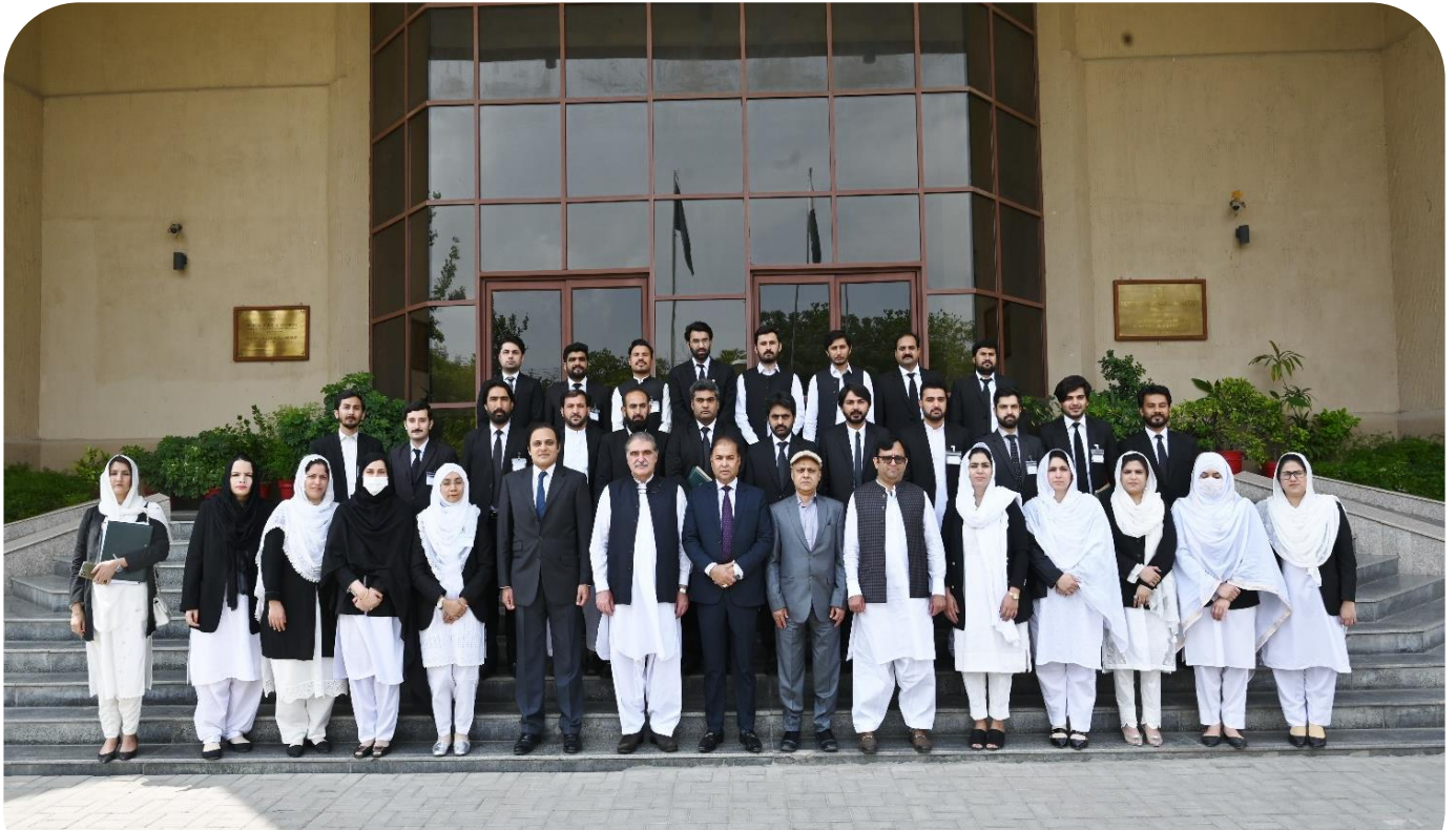
A group photo of participants with DG, FJA and Faculty Members