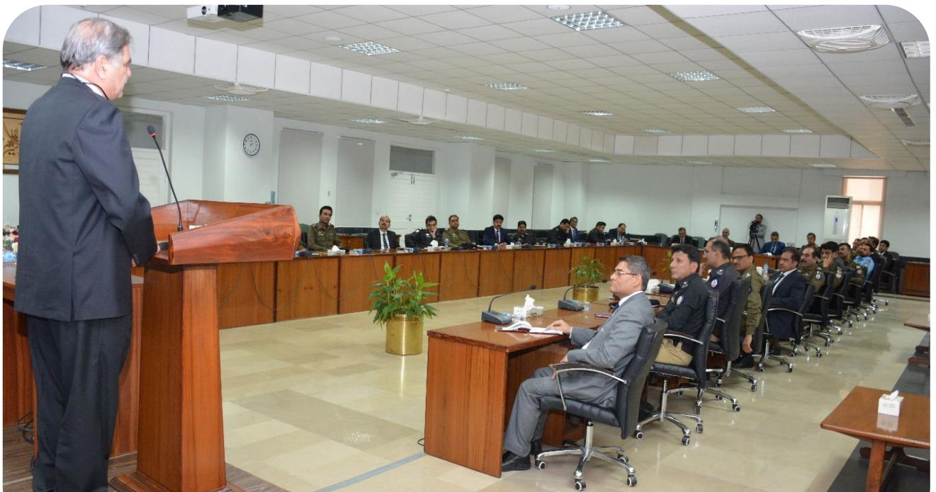
DG, FJA in an interactive session with the officers of 36 th MCMC from NPA

The participants were briefed on the work and mandate of FJA. The distinguished DG (Director General) of FJA, actively engaged with participants and addressed their inquiries regarding the gaps within the criminal justice system. They shed light on the gray overlapping areas that exist between the roles and responsibilities of the police, investigation agencies, and the judiciary. The session concluded with a vote of thanks and refreshments.