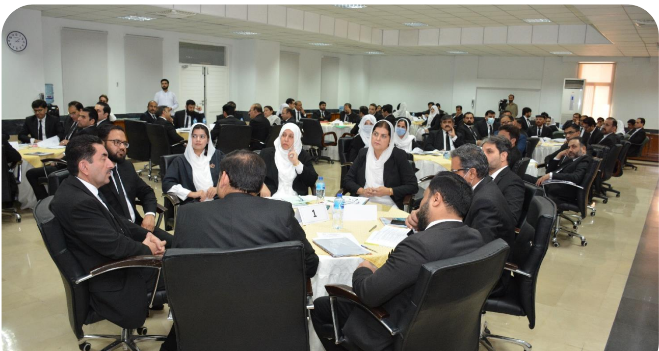
participants of the symposium during participatory discussion

This initiative by the FJA played a significant role in fostering a culture of alternative dispute resolution, ultimately contributing to the overall improvement of the judicial system in Islamabad.