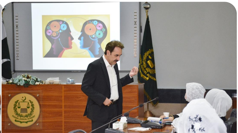
Director, FJA at a discourse in the class