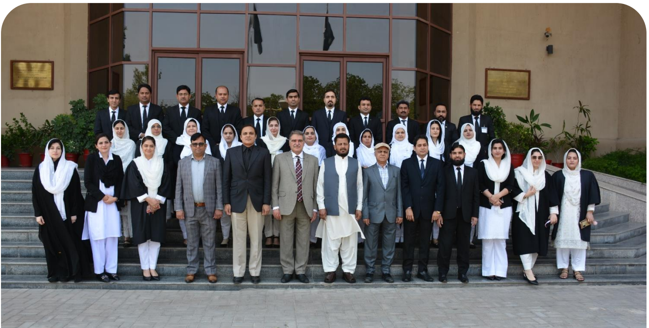
Course Participants in a group photo with DG, FJA and Faculty Members