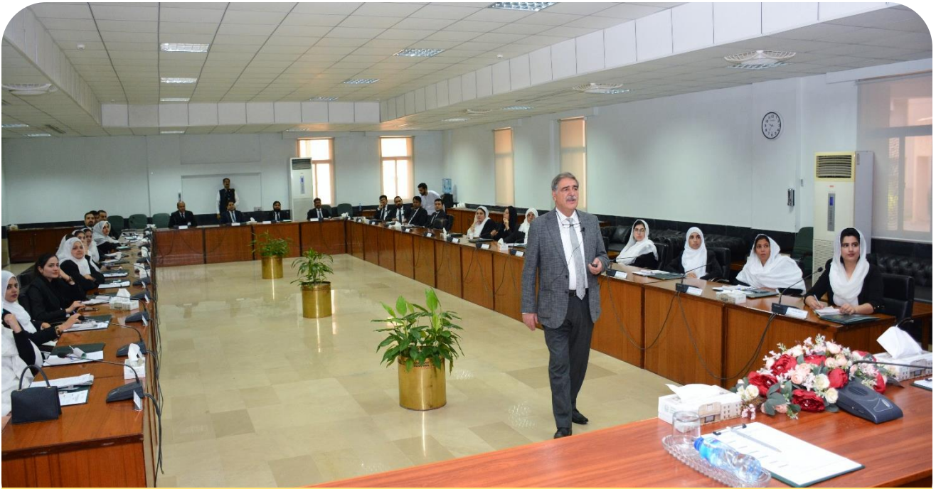
DG, FJA delivering lecture on 'Patience Like a Judge'