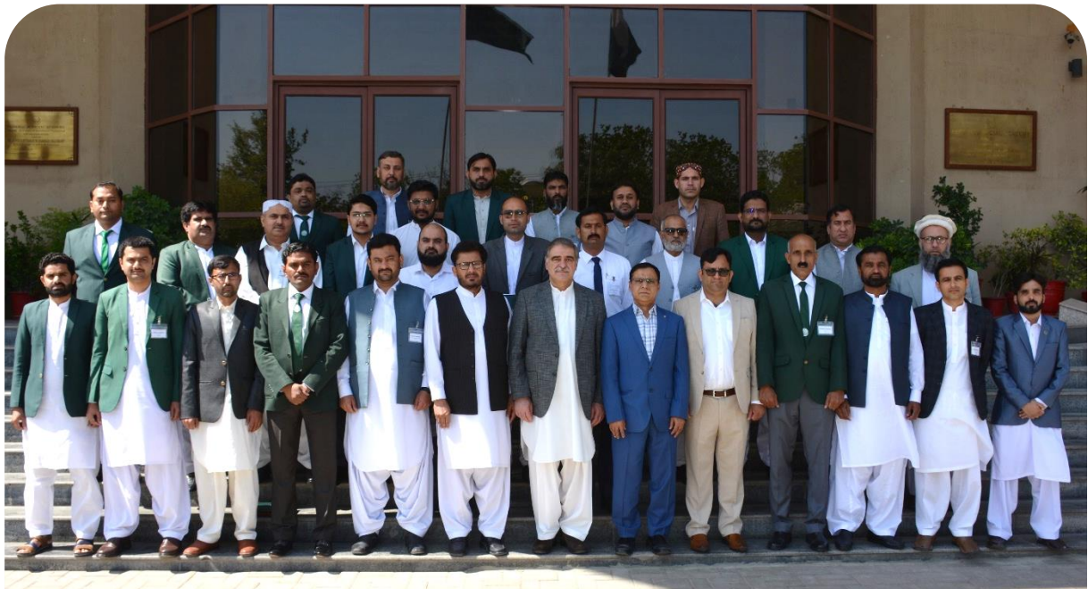
Course participants in group photo with DG, FJA and Faculty Members