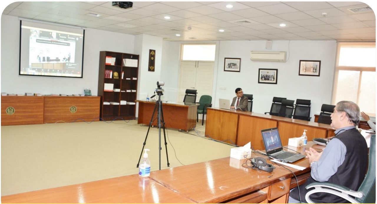
DG, FJA addressing webinar session via Zoom Meeting