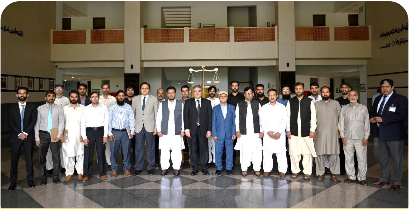
Course Participants in a group photo with DG, FJA and Faculty Members