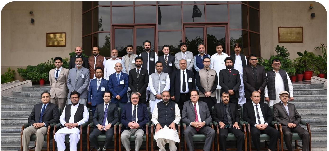
Course Participants in group photo with DG, FJA and Faculty Members