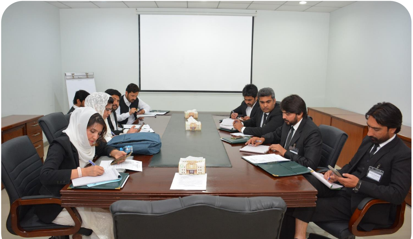
Participants during the Syndicate Discussion