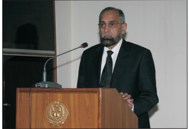
Hon'ble Mr. Justice Anwar Zaheer Jamali

Hon'ble Judge Supreme Court of Pakistan, Mr. Justice Anwar Zaheer Jamali has stressed upon the judges of district judiciary to give momentum to the effective use of, 'Alternative Dispute Resolution' (ADR)