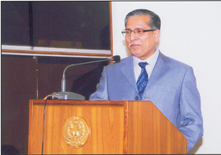
Hon'ble Mr. Justice Ghulam Rabbani

Hon'ble Judge Supreme Court of Pakistan, Mr. Justice Ghulam Rabbani has said that the Alternative Dispute Resolution (ADR) was a quicker, inexpensive and more effective system alternate to litigation being time consuming and expensive.