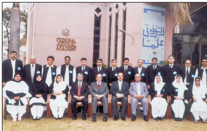
Trainee Judges in Group photo with Hon'ble Mr. Justice Tassaduq Hussain Jillani

Mr. Justice Jillani opined, "Unfortunately, both Islamic thought and tradition have been misinterpreted and distorted