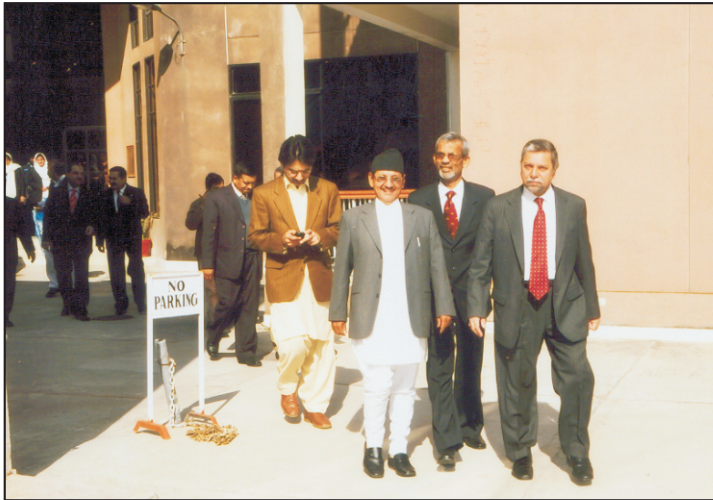
Chief Justice Supreme Court of Nepal, Rt. Honorable Mr. Ram Prasad Shrestha coming back after visiting FJA Hostel

the Chief Justices of the SAARC countries have been mutually beneficial. I, therefore, take my visit to your country as a step towards this direction" he maintained.