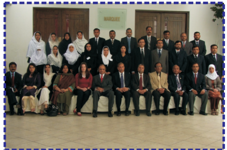
Workshop participants in group photo at Lahore

Respect the Child. Be not too much his parent. Trespass not on his solitude.