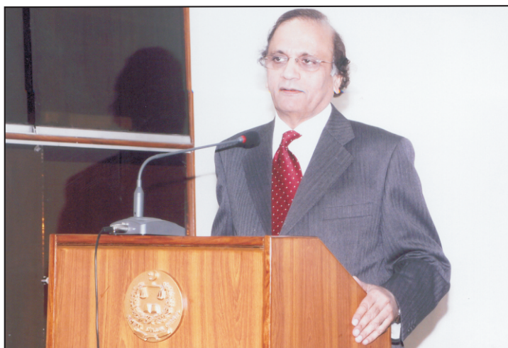
Mr. Justice Tassaduq Hussain Jillani Hon'ble Judge Supreme Court of Pakistan/ Judge Incharge (Academics) FJA

Judge Supreme Court of Pakistan, Mr. Justice Tassaduq Hussain Jillani has urged the Judges of district judiciary to play their due role in the promotion of religious tolerance in the country.