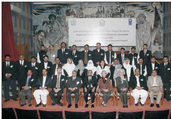
Participants of the ADR orientation training in group photo with Hon'ble Mr. Justice Anwar Zaheer Jamali and Foreign resource persons

The Local Government Ordinance, 2001 provides for a Musalihat Anjuman in every Union Council for provision of easy, accessible and free dispensation of justice to people especially the vulnerable segments of society, i.e. women, children, elderly and poor. It is again an honour that probably Musalihat Anjuman is the only institution which has been retained by all the provinces in their respective draft Local Government Laws. During the interim period through the executive orders all the four provinces have retained Musalihat Anjuman in their respective Provinces.