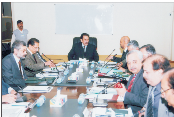
Hon'ble CJP/Chairman FJA BoG in the chair, Hon'ble Vice Chairman FJA BoG, Federal Law Minister and other Hon'ble members in the meeting

During the meeting Dr. Zaheerddin Babar Awan, Federal Minister for Law, Justice and Parliamentary Affairs opined: Government on its part remains fully committed to elevate, upgrade and improve the judicial system in the country. We want that the FJA may emerge as an effective and quality training institute and with futuristic vision and insight.