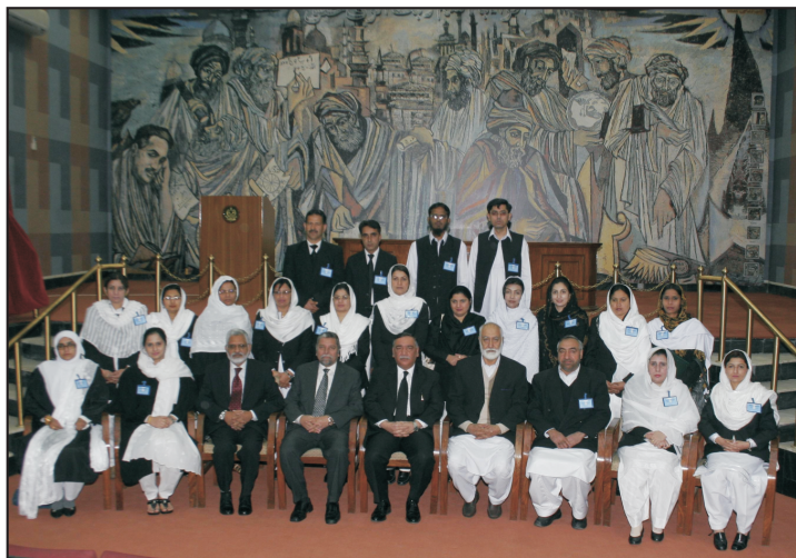
Trainee Judges in group photo with Mr. Justice Asif Saeed Khan Khosa and FJA Faculty members in FJA Auditorium

Regarding the main purpose behind setting up the Family Courts Hon'ble Judge of the Apex Court said, "The Family Courts' main purpose is to assist the smooth and effective disposal of cases relating to family matters such as marriage, divorce, alimony, child custody etc. An effective way of tackling the problem of pendency is to improve the efficiency of the system. A significant step is to make use of the available human resource."