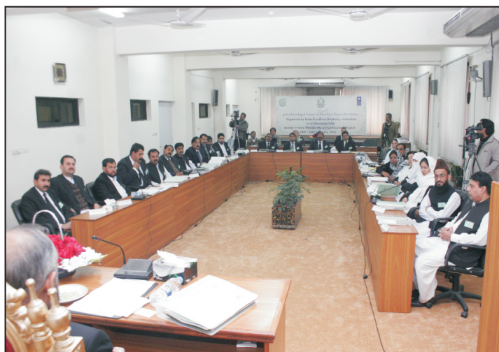
Participants in a Seminar Room

It is apt to mention here that Gender Justice through Musalihat Anjuman Project (GJTMAP) is a joint venture of the UNDP and Government of Pakistan. The Project goal is "to promote and safeguard the rights and lawful entitlements of all, particularly the vulnerable segments of society, by institutionalizing a community supported Alternative Dispute Resolution (ADR) mechanism through the entity of Musalihat Anjuman (MAs)". Initially the project was launched in eight selected districts in October 2006 which was later on expanded to twenty selected districts. Since then the project has formed Musalihat Anjumans at each Union Council in the twenty selected project districts and trained 18,500 stakeholders including Musaleheen, Union Council Secretaries and elected members of the Union Councils in gender sensitization and legal literacy.