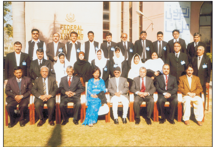
Trainee Judges posing for a photograph with Chief Justice Supreme Court of Nepal, Rt. Honorable Mr. Ram Prasad Shrestha and other members of Nepalese Judicial delegation at FJA

He opined: As members of the judicial family we should be very careful against the possible infringement on the principle of the rule of law. The politicians on occasion want a judiciary committed not to the rule of law rather to their own partisan interests and preferences. Besides, conflict, growing insecurity, lawlessness and impunity often pose serious challenge to the rule of law. As attendants of the rule of law, we judges should be courageous and able to play proactive role to safeguard the principle of rule of law and basic values of democracy.