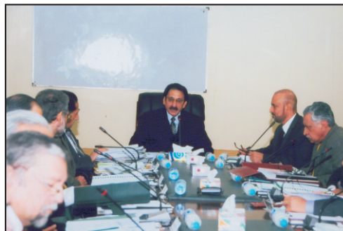
Hon'ble Chief Justice of Pakistan, Mr. Justice Iftikhar Muhammad Chaudhry presides over the 34 th Board of Governors meeting.