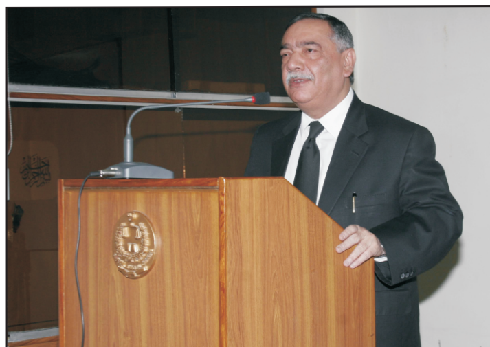
Hon'ble Mr. Justice Asif Saeed Khan Khosa Addressing Family Court Judges

Family breakdown can victimize children in many ways. It can effectively deprive them of a parent. Where children's