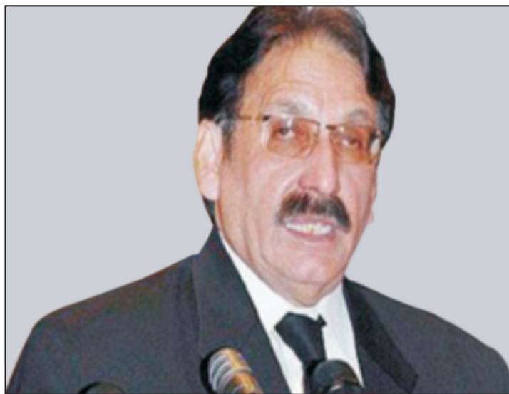
Hon'ble Mr. Justice Iftikhar Muhammad Chaudhry, Chief Justice of Pakistan

Hon'ble Chief Justice of Pakistan, Mr. Justice Iftikhar Muhammad Chaudhry, has said that the Rule of law was 'sine qua non' for democracy and overall development in the country.