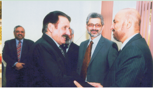
Hon'ble CJP/Chairman FJA BoG exchanges Pleasantries with Dr. Baber Awan, Federal Law Minister/ Vice Chairman FJA BoG