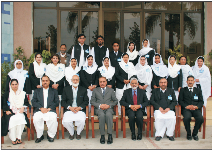
Trainee Judges in Group Photo Hon'ble Mr. Justice Tariq Parvez

"Sessions Judges do not enjoy special Jurisdiction for conciliation in murder and other criminal cases but it is the Family Court Judges who are granted special jurisdiction, therefore, they need to make full use of the given section (10) its sub-section (3) of the law and attempt conciliation and compromise between the parties. You need not to assert pressure or compel the parties for the purpose but use the force of your persuasion and save matrimonial relations from further deterioration" he observed.