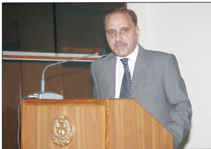
Hon'ble Mr. Justice Tariq Parvez

Judge Supreme Court of Pakistan Mr. Justice Tariq Parvez has advised the Family Court Judges to make meaningful and determined effort so that maximum number of family matters cases are settled through conciliation and compromise between the parties.