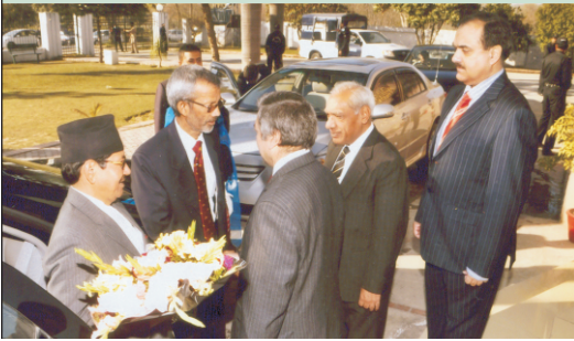
FJA Faculty Members warmly Receiving Chief Justice Supreme Court of Nepal, Rt. Honorable Mr. Ram Prasad Shrestha