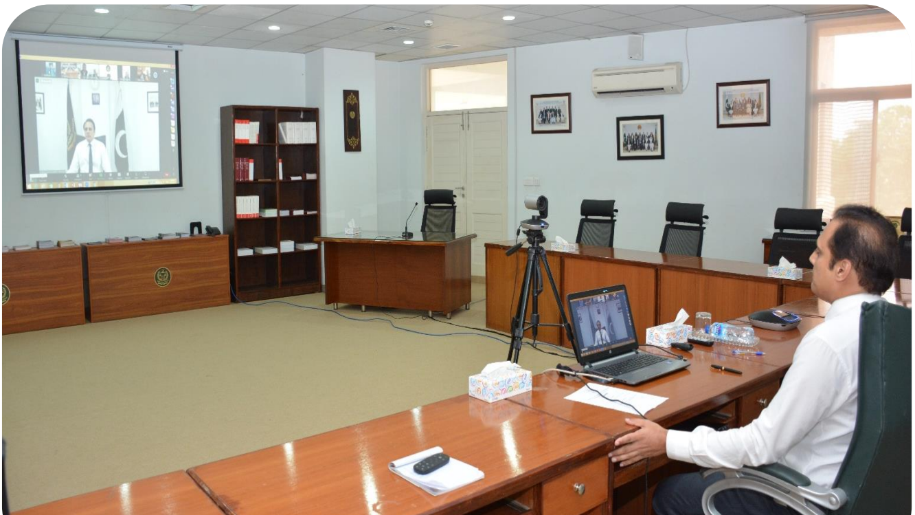
Addl. Director, FJA conducting webinar at Research Lounge FJA

By offering a space for Civil Judges to engage in meaningful discussions, ask pertinent questions, and gain exposure to the latest developments in the realm of digital law, the Academy embodied its commitment to equipping judicial officers with the tools and knowledge necessary to address contemporary legal challenges and reaffirms its role as a vanguard of judicial education.