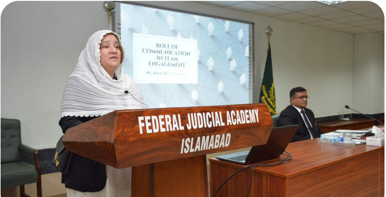
Course participant delivering syndicate presentation