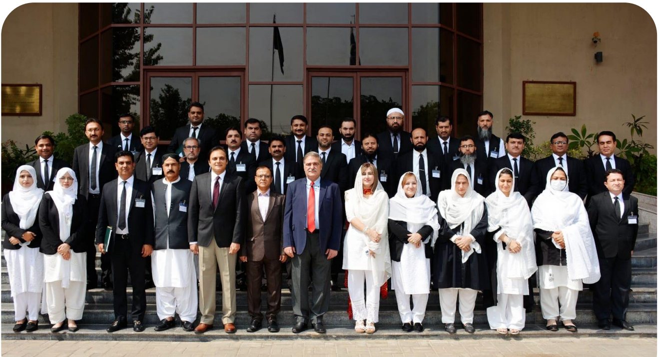
Group photo of Course Participants, (Senior Civil Judges from all over Pakistan) with DG, FJA, and Faculty Members