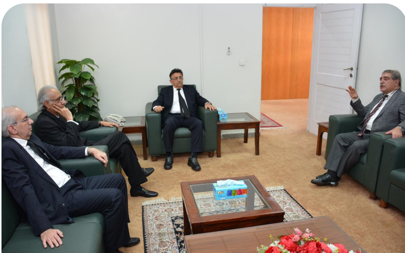
Hon'ble Chief Justice of Pakistan Mr. Justice Umar Ata Bandial and FJA's administrative committee members in discussion with DG, FJA

Their presence symbolized not just a farewell but a profound acknowledgment of the institution's vital role in shaping the legal landscape. This meeting, blending a sense of nostalgia with institutional evaluation, marked a significant chapter in the journey of justice in Pakistan.