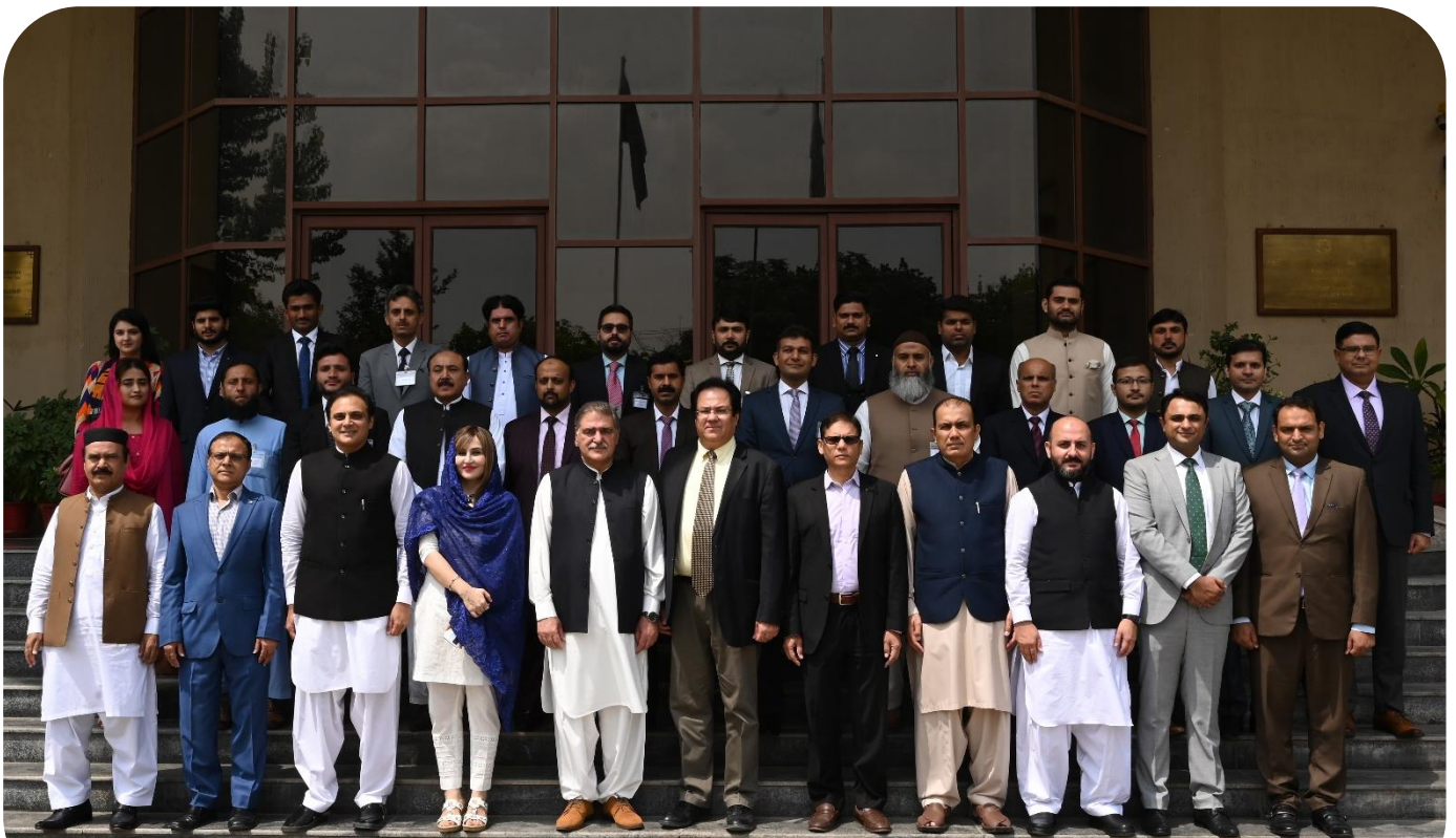
A group photo headed by DG, L&M Cell Ministry of Law & Justice and DG (FJA), with course participants and Faculty Members