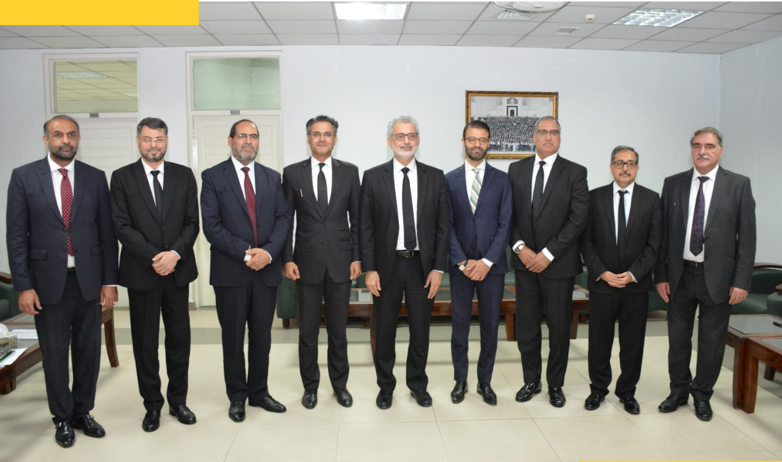
A Group photo of BOG members headed by Chief Justice Qazi Faez Isa (Chairman) FJA