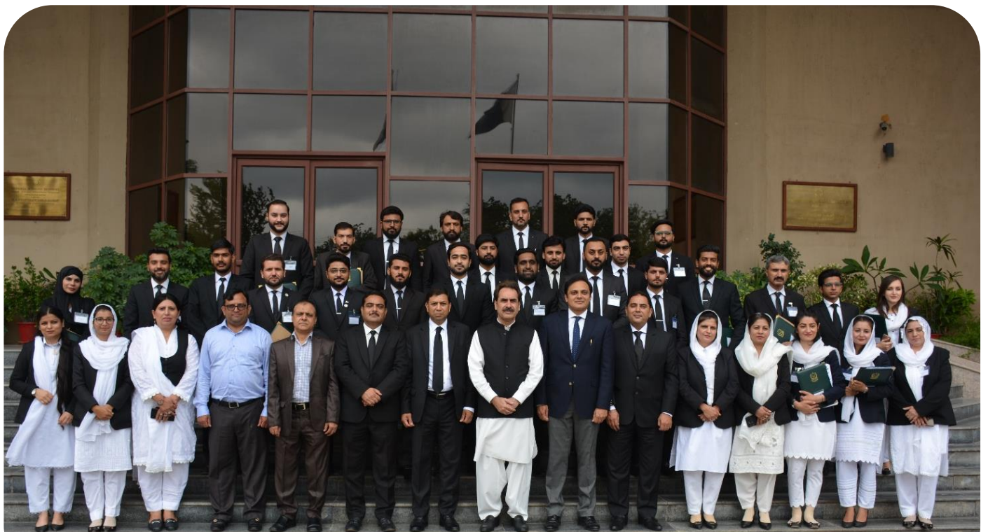
Trainee members of High Court Bar Association, Rawalpindi with Faculty members of FJA