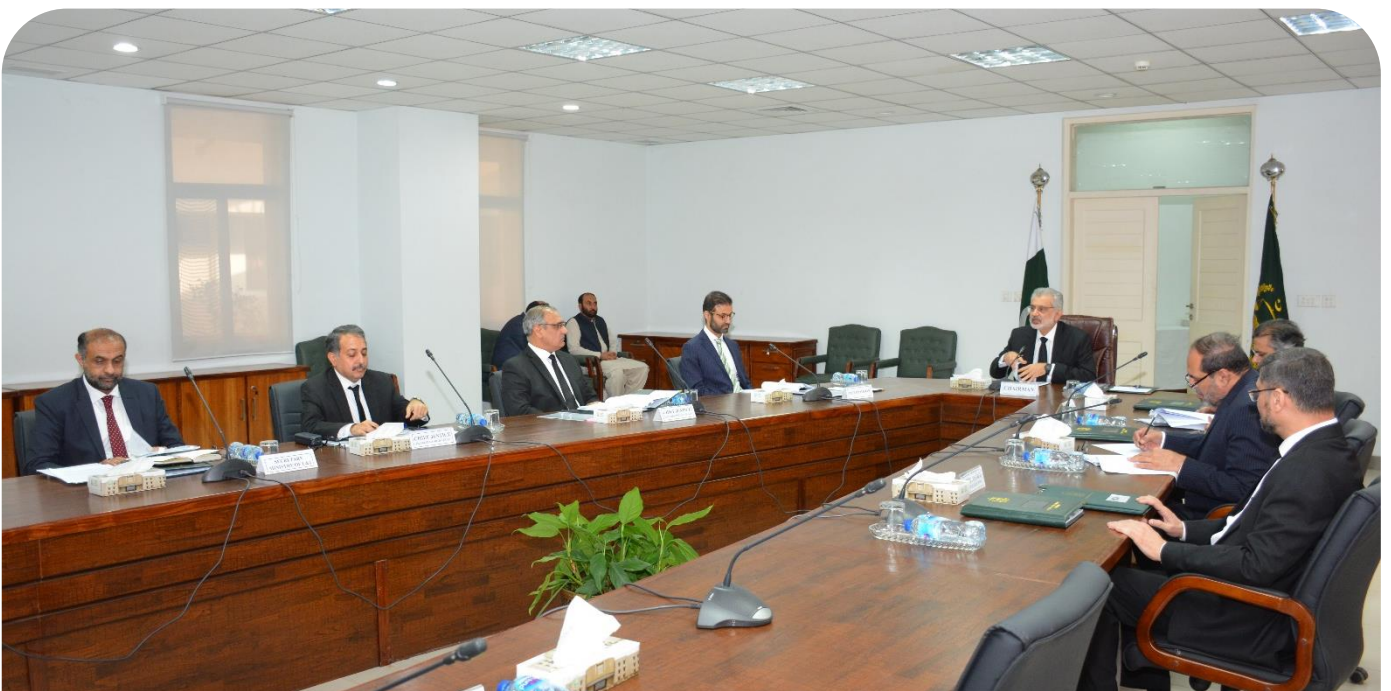
Chief Justice Qazi Faez Isa presiding over meeting of Board of Governors, FJA