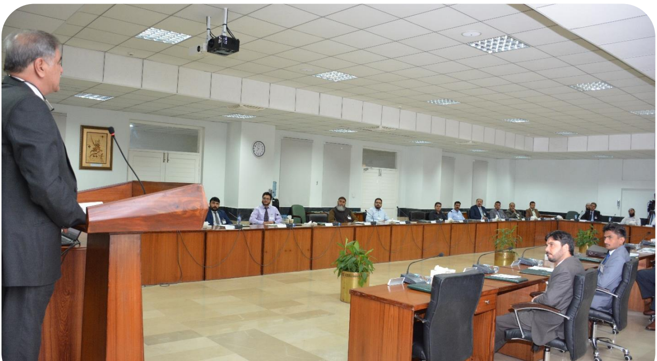
DG, FJA addressing inaugural session of the course

As the five-day endeavor concluded, participants departed with a heightened understanding of legal intricacies, poised to bring newfound perspectives to their roles within the Federal Ministries, Divisions, and Attached Departments.