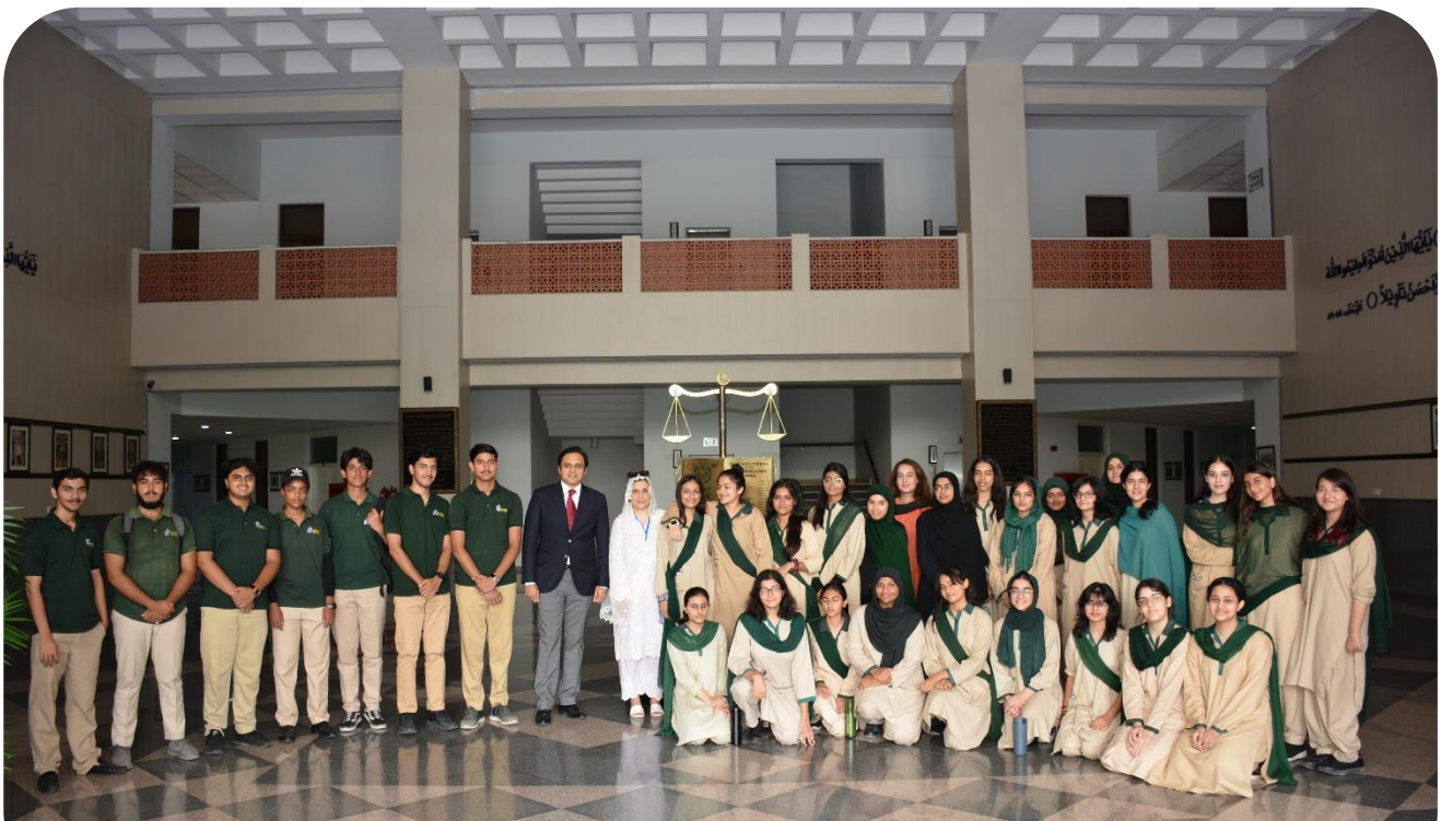
Visit participants (A-Level Law Students along with their faculty members) in group photo with Addl. Director, FJA

The visit was carefully curated to blend educational enrichment with practical exposure, allowing the students to witness court proceedings, interact with legal professionals, and explore the various facets of the justice system. Through this immersive experience, the Federal Judicial Academy endeavored to inspire and guide the next generation of legal scholars, fostering a deeper understanding and appreciation for the complexities and nuances of the legal field.