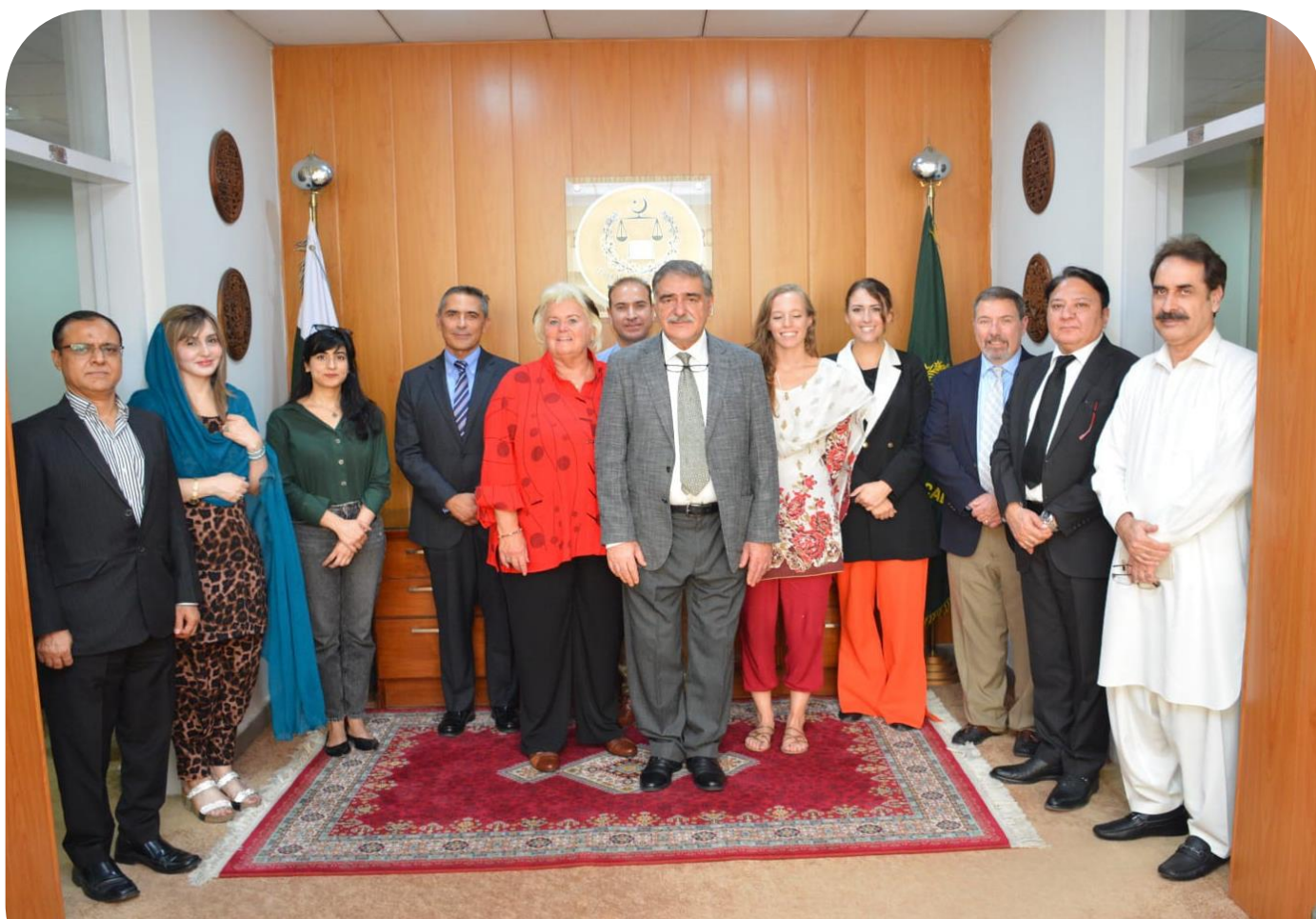
DG, FJA and faculty members with NCSC & CODE PAKISTAN delegation

This gathering served as a platform for robust discussions, fostering collaboration and exchange of ideas between these diverse entities, with a focus on enhancing the judiciary and legal infrastructure. The Federal Judicial Academy, as the backdrop for this consequential meeting, provided a conducive environment for the exploration of innovative strategies and initiatives in the realm of legal development.