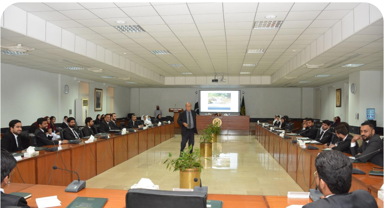
Course participants during a training session

The program aimed to fortify legal professionals with an array of contemporary legal knowledge, equipping them to navigate the complexities of modern law practice while upholding the highest ethical standards. During this intensive training, participants were exposed to a diverse range of legal topics and trends, such as Civil Trial Procedure, Understanding Land Revenue Record, Criminal Trial Procedure. Along with equipping the participants with comprehensive understanding of various facets of law & practice, the training also delved into emerging areas such as use of IT in Justice Sector, Alternate Dispute Resolution (ADR) legal framework, Stress Management, and Ethics in the Legal Profession.