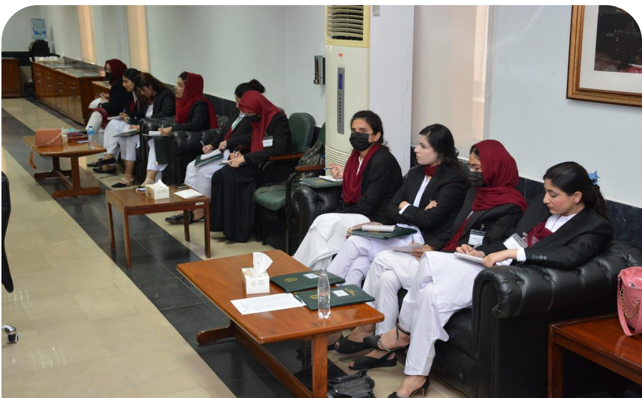
Law Interns attending training course of CLE, Batch-XVI

Spanning a duration of six weeks, the legal internship program operates under the supervision of the Director Academics & Training and Director Research & Publication at the Federal Judicial Academy. The journey of this internship is comprehensive, encompassing a blend of educational components, an amalgamation of instructive lectures, practical research assignments, and exposure to professional development courses, all culminating in the submission of a research project. Throughout this transformative experience, participants have the privilege of utilizing the research lounge at the FJA, creating an environment conducive to immersive learning.