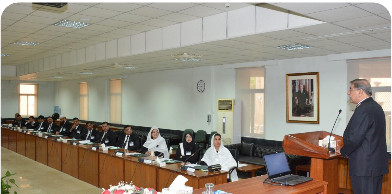
DG, FJA during the inaugural session of Leadership & Management course for Senior Civil Judges

As the week-long training concluded, the Senior Civil Judges from Batch-III emerged with a refined leadership acumen, fortified management skills, and a strengthened sense of camaraderie with their peers. The Federal Judicial Academy's commitment to advancing the capabilities of judicial officers was evident in this targeted initiative, paving the way for enhanced leadership within the judicial sphere across Pakistan.