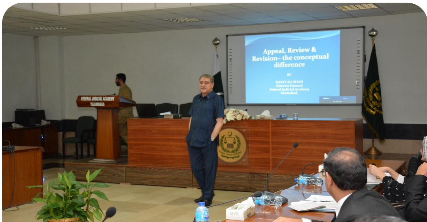
DG, FJA delivering lecture on “Appeal, Review & Revision- the conceptual difference.”