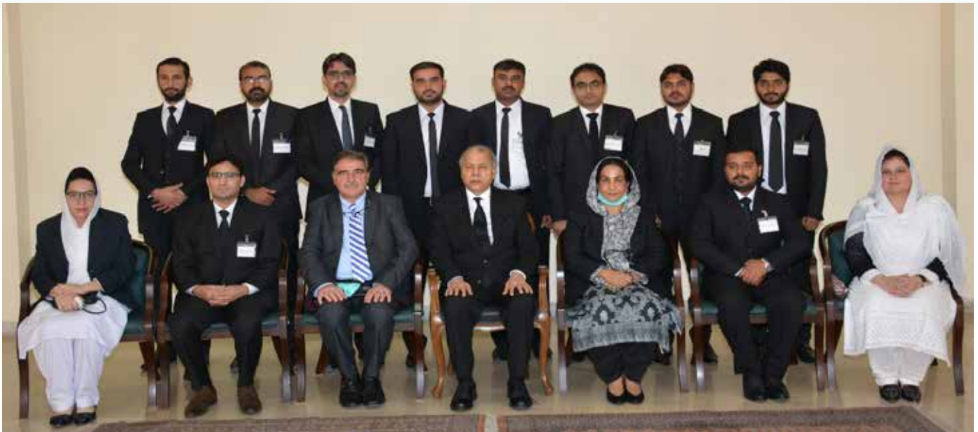
Trainee Assistant Directors Legal from Federal Investigation Agency in group photo with Mr. Justice Gulzar Ahmed, Honourable Chief Justice of Pakistan at the Supreme Court of Pakistan on September 17, 2020.