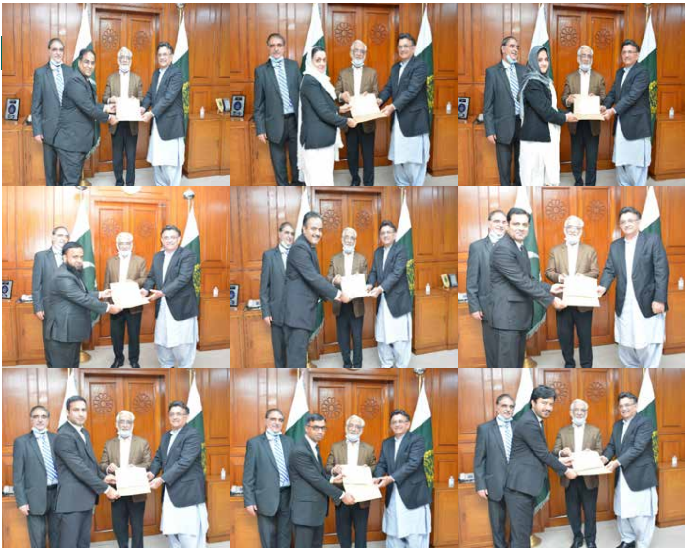
Honourable Mr. Justice Muhsir Alam and Honourable Mr. Justice Umar Ata Bandial awarding certificates to the participants of Research Cycle -II at the Supreme Court of Pakistan.