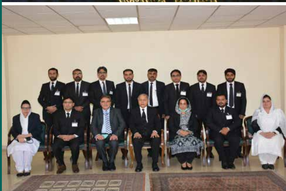
Trainee Assistant Directors Legal from Federal Investigation Agency in group photo with Honourable Chief Justice of Pakistan, Mr. Justice Gulzar Ahmed at the Supreme Court of Pakistan on September 17, 2020.