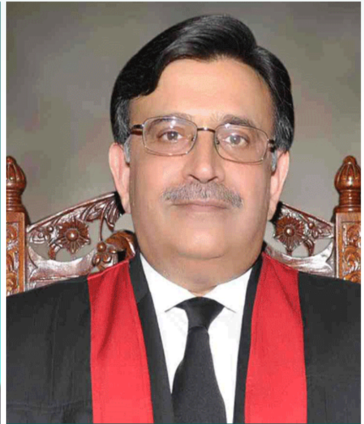
Mr. Justice Umar Ata Bandial

In line with the policy guidelines of Hon’ble the Chief Justice of Pakistan requiring research skills for judicial officers, Federal Judicial Academy in collaboration with International Committee of Red Cross (ICRC) had launched Research Cycle-II on “Response of Criminal Justice System to Urban Violence”.