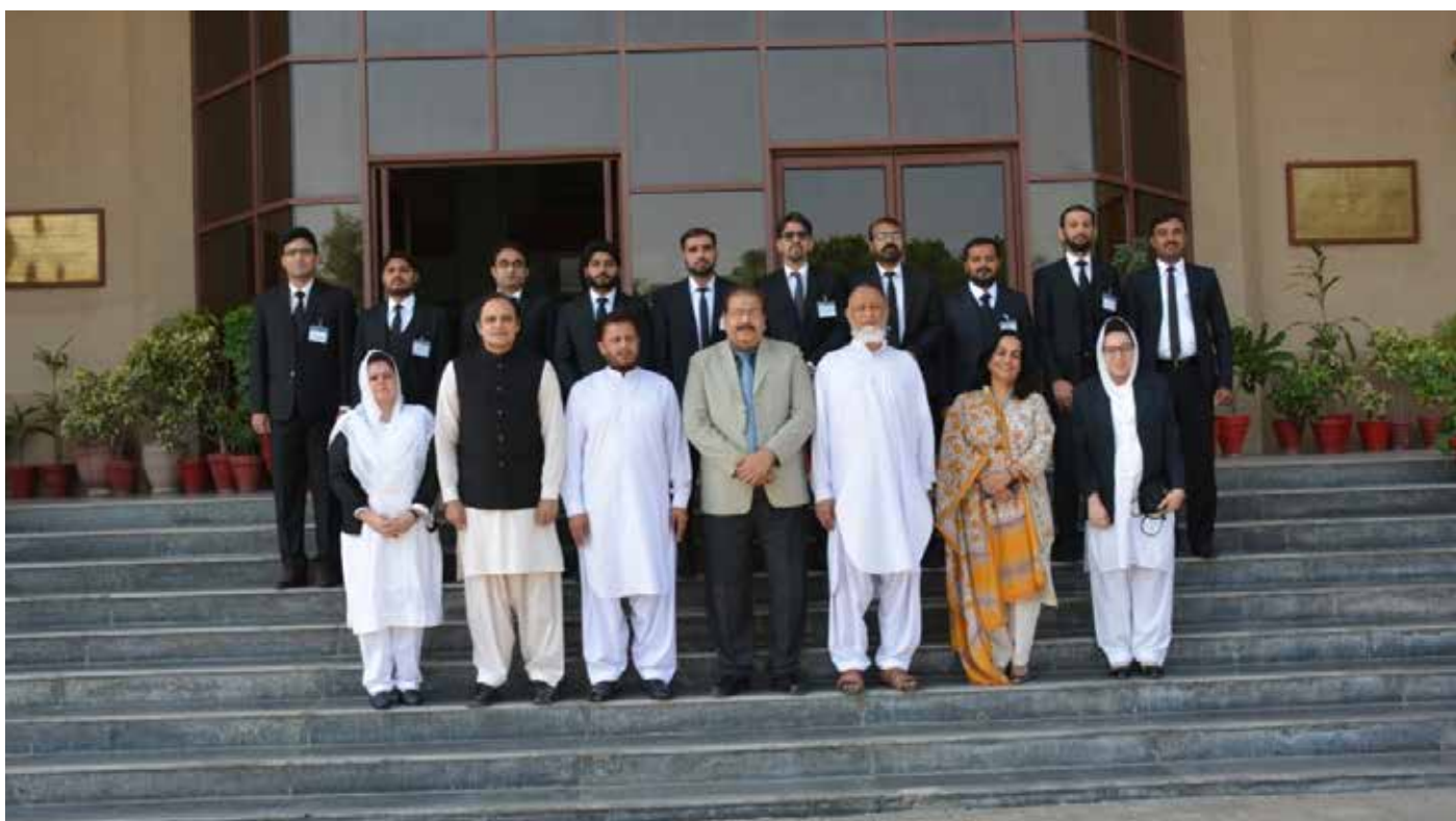
Assistant Directors (Legal), Federal Investigation Agency in group photo with faculty members on September 19, 2020.

A weeklong Pre-Service Orientation Course for Assistant Directors (Legal) FIA from September 14 to 19, 2020 was conducted at the Federal Judicial Academy in which twelve Assistant Directors Legal participated.