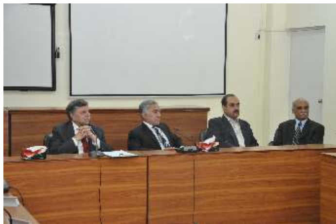
DG, FJA and Faculty members in an informal interactive session with the course participants.

He said, “Like other professionals, members of the legal fraternity should strictly adhere to the professional ethics, the legal bodies should discourage the renegade members and they should actively cooperate with the bench to