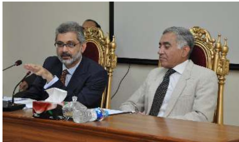
Hon'ble Mr. Justice Qazi Faez Isa addressing the course participants. DG, FJA, also in the picture.

Regarding human interaction and learning, he said, “Human interaction is vital for learning and re-learning. Human learning enriches by interacting with the outside world. Young judicial officers must interact with each other during their training in the Academy and try to