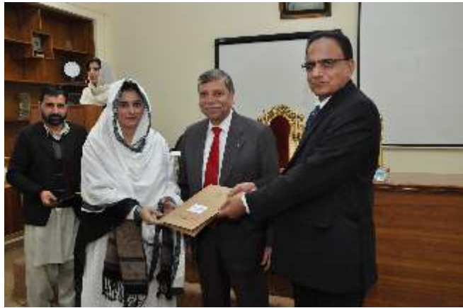
Awarding certificate to a course participant.