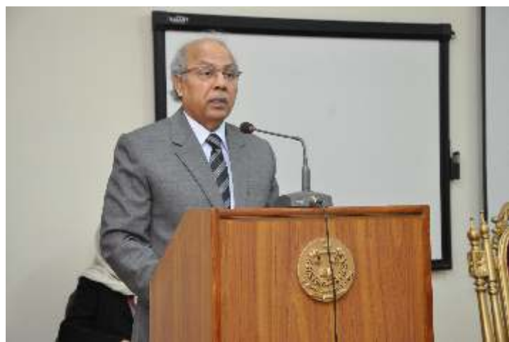
Hon'ble Mr. Justice Gulzar Ahmed addressing the course participants.

He said, "Family cases are not just cases but social problems in our society. Families are the cells which make up the body of society, if these cells are broken then the entire society suffers. Family break-up is indeed the collapse of the family unit and it has many harmful effects. A child of such an ill-fated family bears the brunt. He/she remains deprived of the three core human values such as love, care and confidence. A mother cultivates love in him/her for family and fellow beings and the father provides him/her care and adequate provisions, both the parents inculcate confidence and determination. We know that the children of