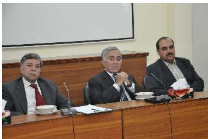
Faculty members in an informal interactive session with the course participants.

The participants who were twenty in number actively participated in the informal session and spoke about their professional problems and a