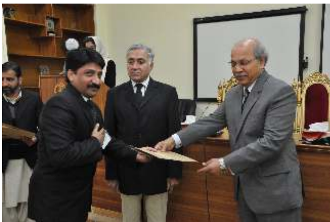
Awarding certificate to a course participant.

In his address, the honourable Judge also shed light on other subjects such as Administrative/Financial Management, Alternative Dispute Resolution, etc. incorporated in the one week training of the Senior Civil Judges and urged the participants to utilize the knowledge gained from here to serve the people.