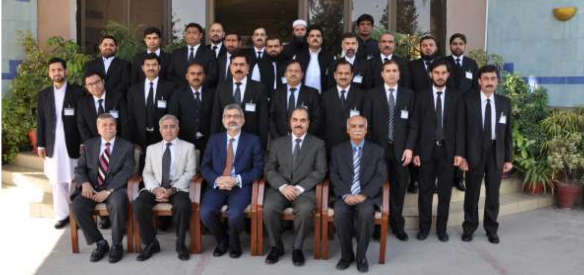
Course participants in a group photo with Hon'ble Mr. Justice Qazi Faez Isa, and faculty members.

training institutes around the globe with special focus on Pakistan, emergence of new laws, new trends and efficacy and usability of the National Judicial Policy for dispensation of expeditious justice to the public.