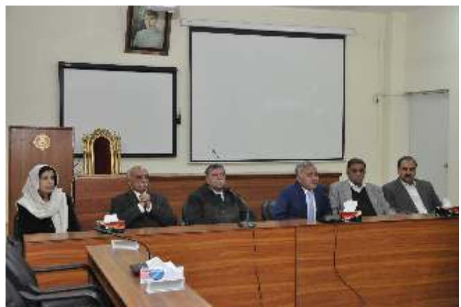
DG, Faculty members and Resource Person in an informal interactive session with the course participants.