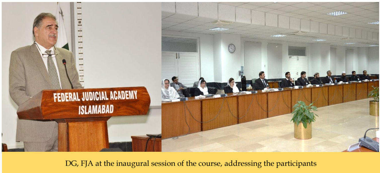
DG, FJA at the inaugural session of the course, addressing the participants

This engaging programme aids ADJs in exploring key trial concepts including jurisdiction, representation, and mandatory procedure. This program's goal is to provide these judges with the information and abilities they need to conduct trials more effectively.