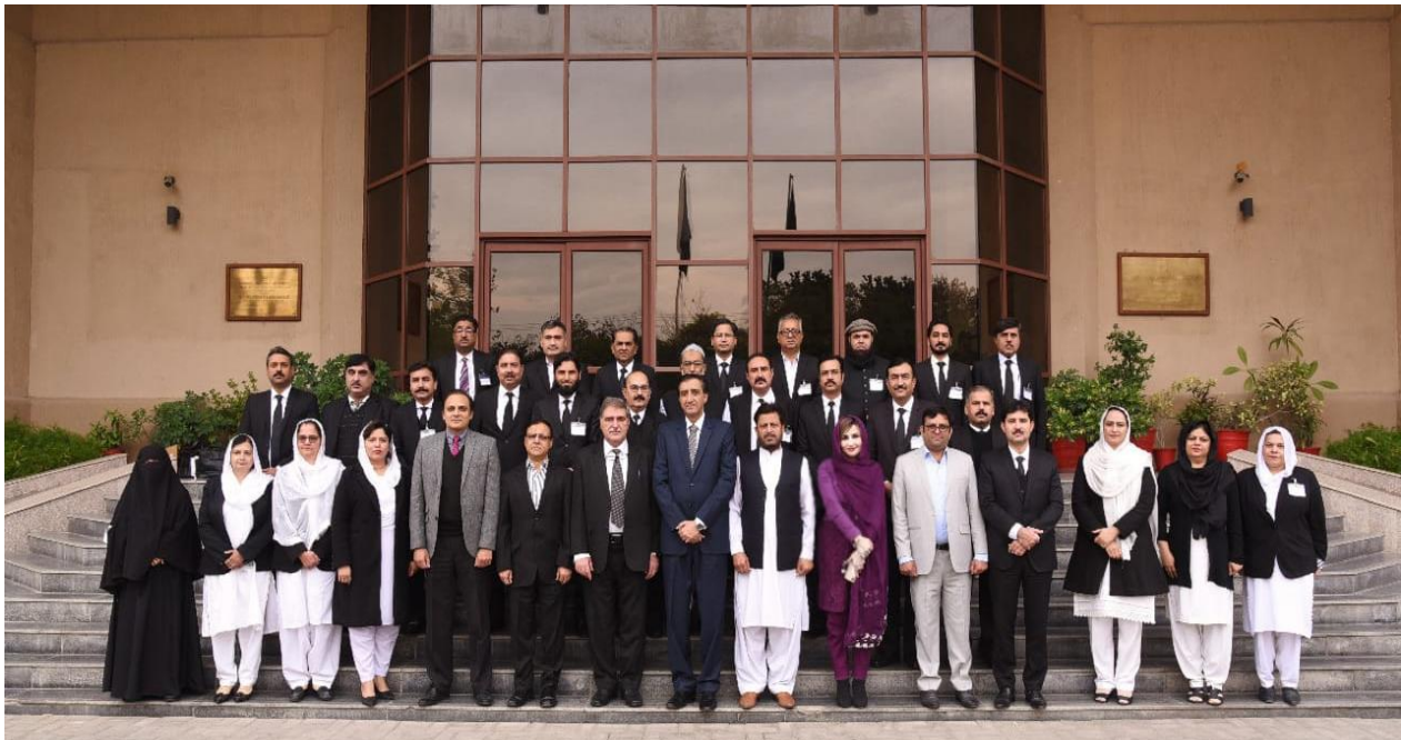
Course Participants in a group photo with DG FJA and faculty members