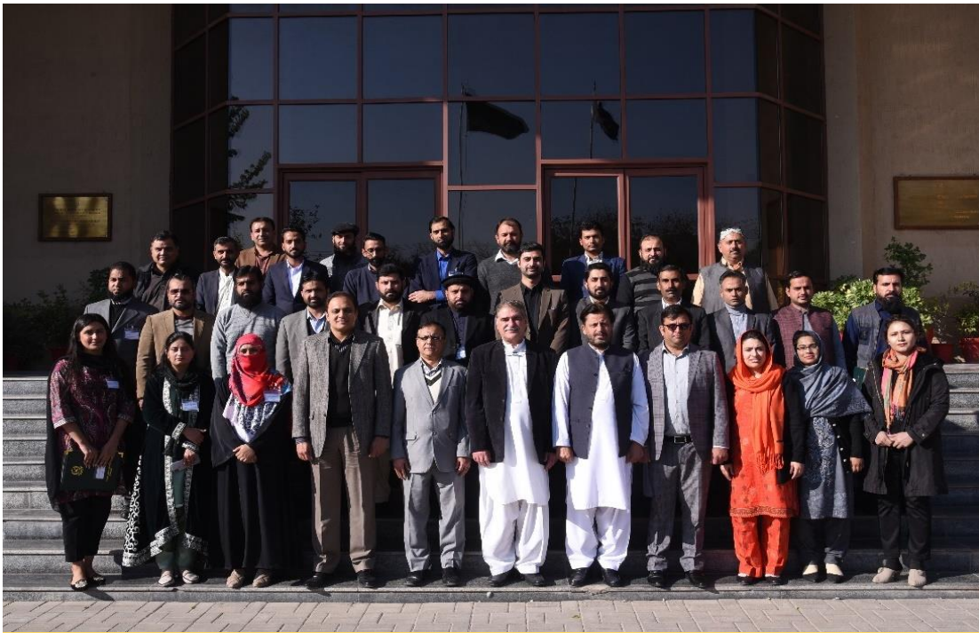
Group photo of the Course participants with DG FJA and faculty members