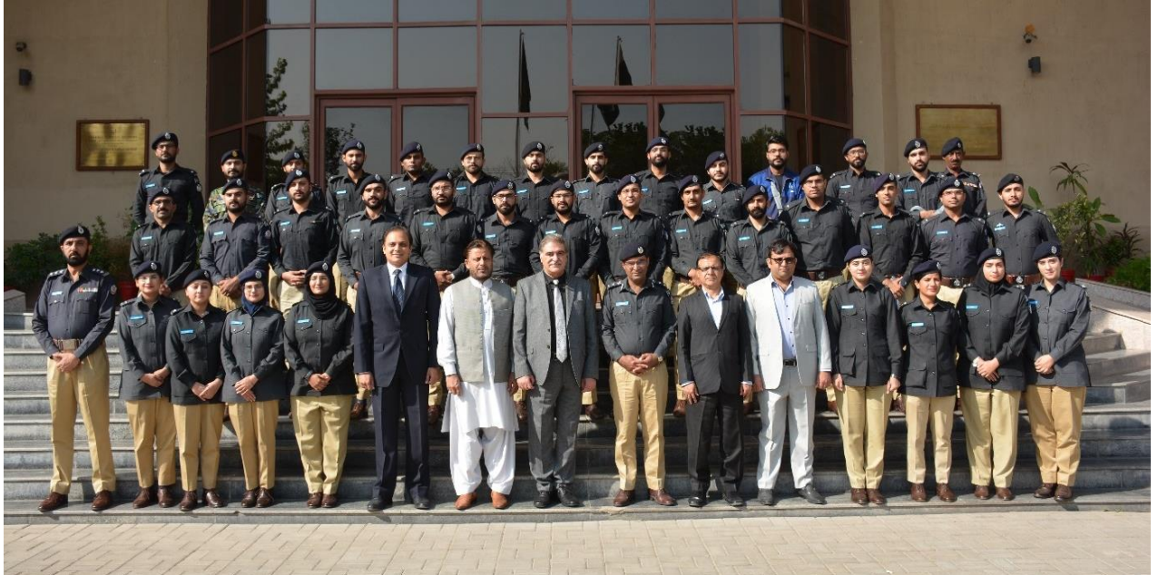
Course participants in group photo with FJA, faculty members