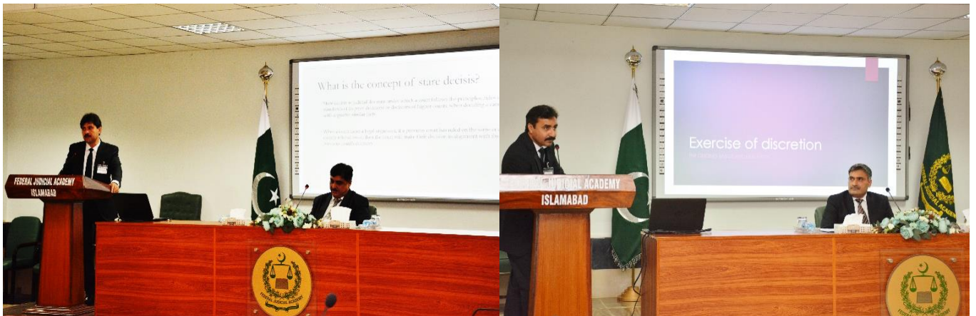
Participants delivering the syndicate presentation