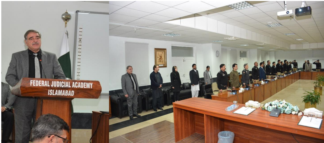
DG, FJA addresses the participants