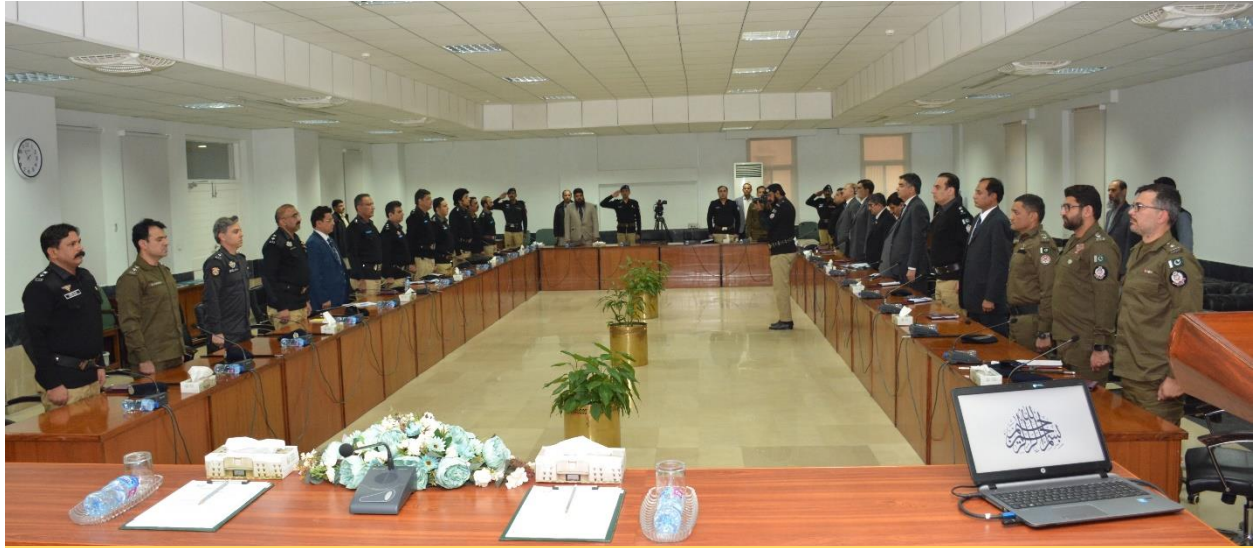
National Police Academy faculty and participants at FJA

FJA hosted one day workshop on 29 th of December 2022 for 6th Domain Specific Training Course of 35 th MCMC for PSP/ FIA/ NAB cadre comprising of 6 faculty members and 28 participants who are expected to be promoted from BPS-18 to BPS-19, after successfully completing MCMC at National Police Academy, Islamabad (NPA).