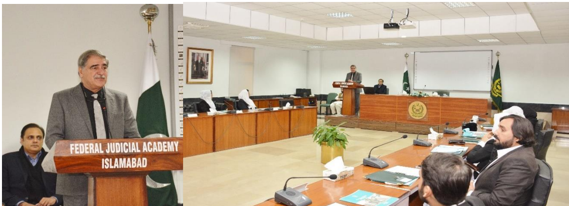
DG, FJA at the inaugural session of the course, and addressing the participants (left)

Federal Judicial Academy, Islamabad, launched a one-week training on “Continuing Legal Education” for lawyers from District Bar Association, Mansehra from December 12 to 17, 2022. Areas of Learning included use of IT in Justice Sector, Forensic Medicine and Toxicology, Understanding Land Revenue, Professional Ethics, Civil Trial Procedure, Criminal Trial Procedure, Pleadings, Professional Communication Skills, and Emotional Intelligence.