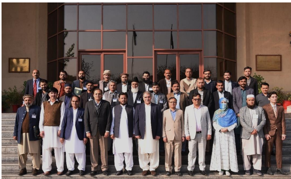
Course participants in group photo with DG, FJA and faculty members