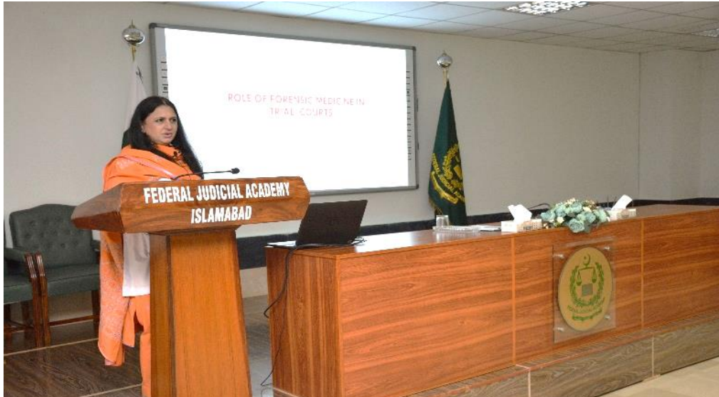
Resource Person delivering lecture on Forensic Medicine