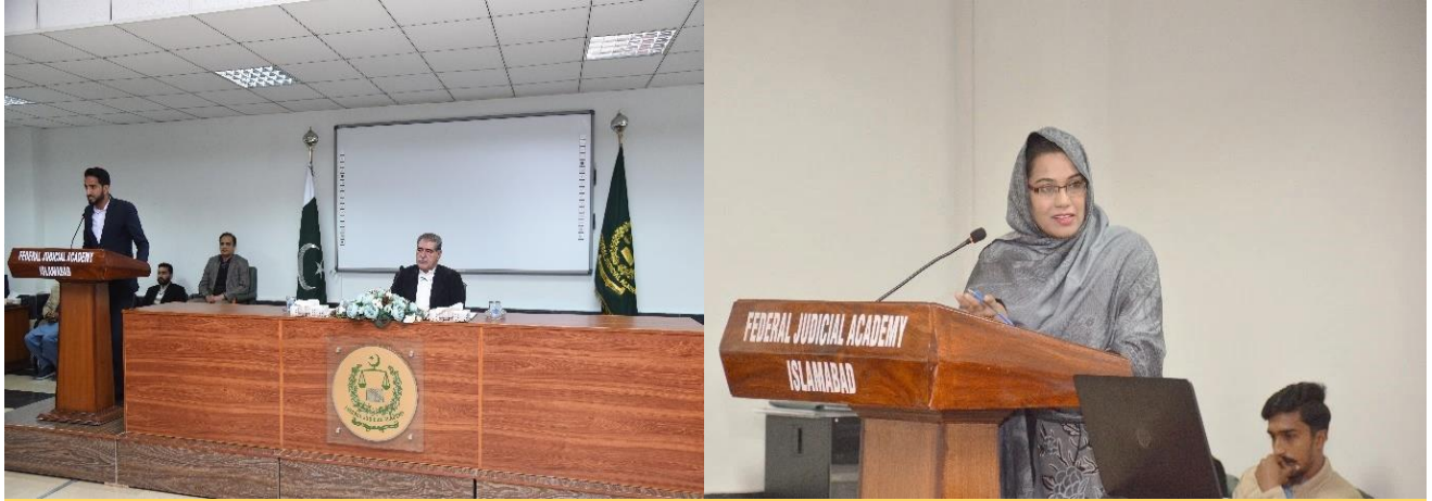
Course participants sharing their views during the recap session