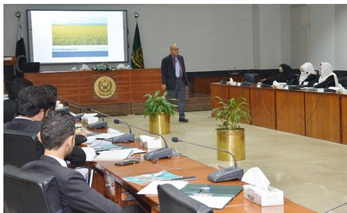
Resource Person delivering lecture