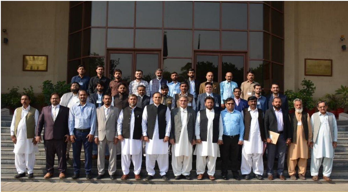
Course participants in Group photo with FJA, faculty members