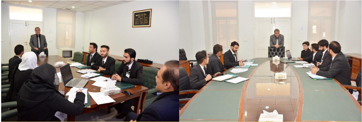
DG, FJA during the syndicate discussion in the board Rooms