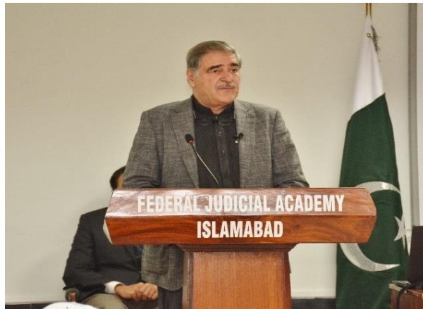
DG FJA, addressing at inaugural session

This programme concentrated on imparting the skills necessary for running offices skillfully and productively. The programme gave each participant a greater grasp of their job as an office manager along with providing information on how to conduct various aspects of office management such as recruitment, hiring, employee training and assessment, budgeting and financial planning. All participants left the session with a better understanding of their job as an office manager and how to improve their performance.