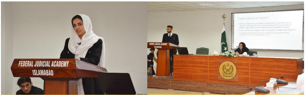
Course participants delivering syndicate presentation