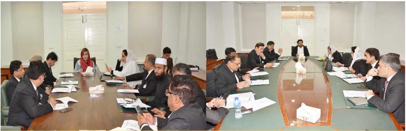
Directors, FJA conducting the syndicate discussion in the board Rooms