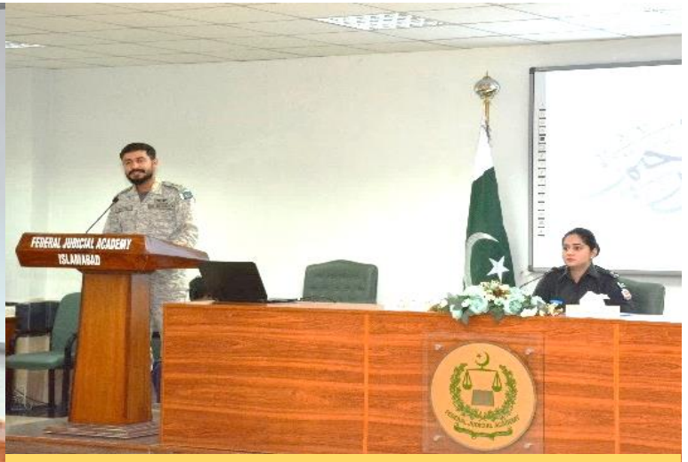
Course Participants delivering syndicate presentations

During this training, participants were introduced to various aspects of policing such as crime prevention, detection, investigation and prosecution. The course aimed at enhancing the role of ASPs as law enforcement agency leaders and trainers by giving them an opportunity to learn about leadership, management, human resources development and ethics.