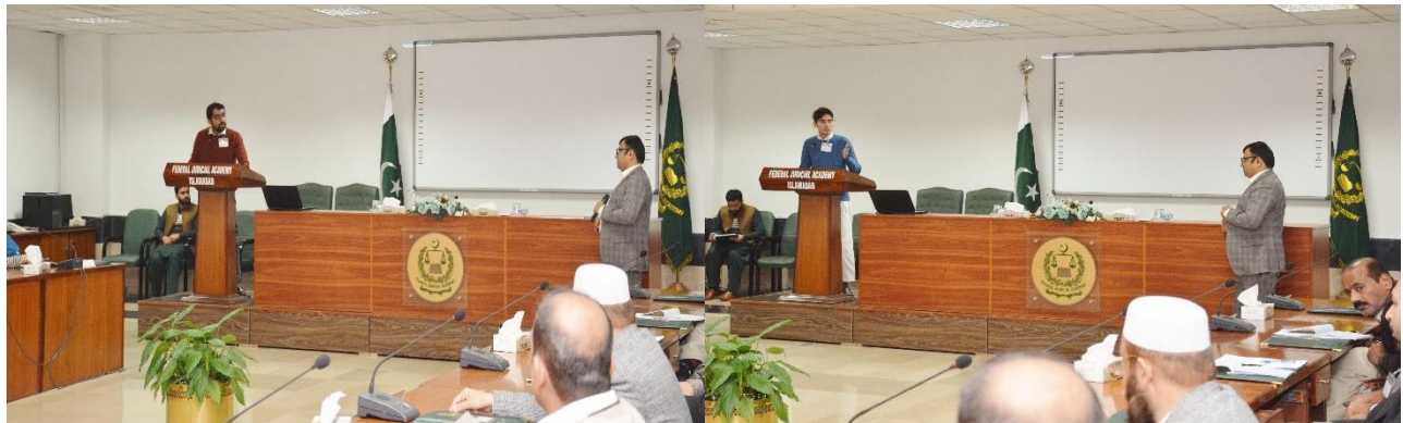
Course participants sharing their views during the recap session