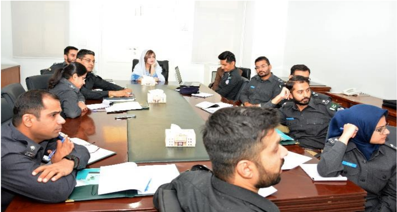
Course Participants in syndicate discussion headed by Director, FJA