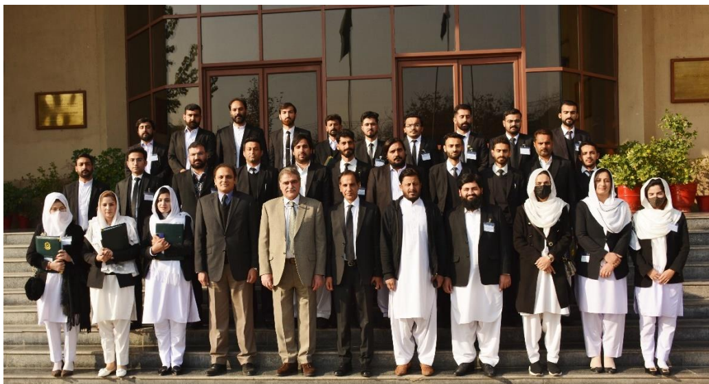
Course participants in a group photo with DG, FJA and faculty members