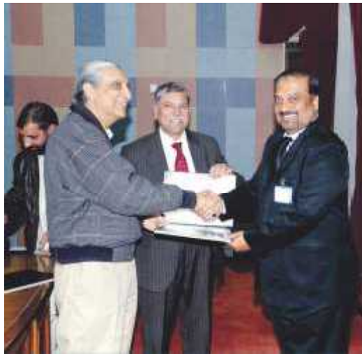
Hon'ble Mr. Justice Jawwad S. Khawaja gives away certificate to a participant

Hon'ble judge said: “Like other courts the role of anti-terrorism courts is significant. These courts are also meant to uphold the rule of law without being swayed by public opinion and consequence. Judges of anti-terrorism courts must adhere to principles and norms of the criminal justice system. The Judges of the anti-terrorism court can't lose the sight of Article 9 of the Constitution which guarantees the security of life and liberty”, he stressed.