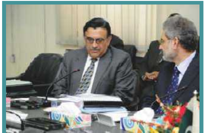
Hon'ble Mr. Justice Qazi Faez Isa, Chief Justice, Balochistan High Court confiding with Hon'ble Mr. Justice Umar Atta Bandial, Chief Justice, Lahore High Court during the meeting

Speaking about "Training of Afghan Judges in Federal Judicial Academy, Islamabad," Hon'ble Chief Justice of Pakistan observed: "Since they are striving for the rule of law in our brotherly country of Afghanistan, hence, we have to help them. We have to impart trainings to their judicial officers and for that he directed the FJA management to expedite the process".