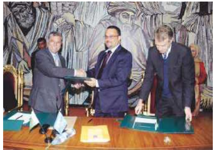
Exchange of MoU, document

A Memorandum of Understanding (MoU) was signed on Monday, 17 th December, 2012 between the Federal Judicial Academy and the United Nations Development Programme (UNDP), UN Office for Project Services (UNOPS) organized by the Legal Empowerment of the Poor (LEP) programme. Hon'ble Mr. Justice Nasir-ul-Mulk, Judge Supreme Court of Pakistan, was the chief guest.