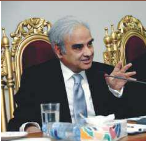
Hon'ble Mr. Justice Nasir-ul-Mulk addressing the course participants

Hon'ble Mr. Justice Nasir-ul Mulk, Judge Supreme Court of Pakistan, highlighted that the people of Pakistan have trust and confidence in the judiciary and they consider it as the last resort, saying “despite having hardships, we have the duty to deliver the justice to the people.”