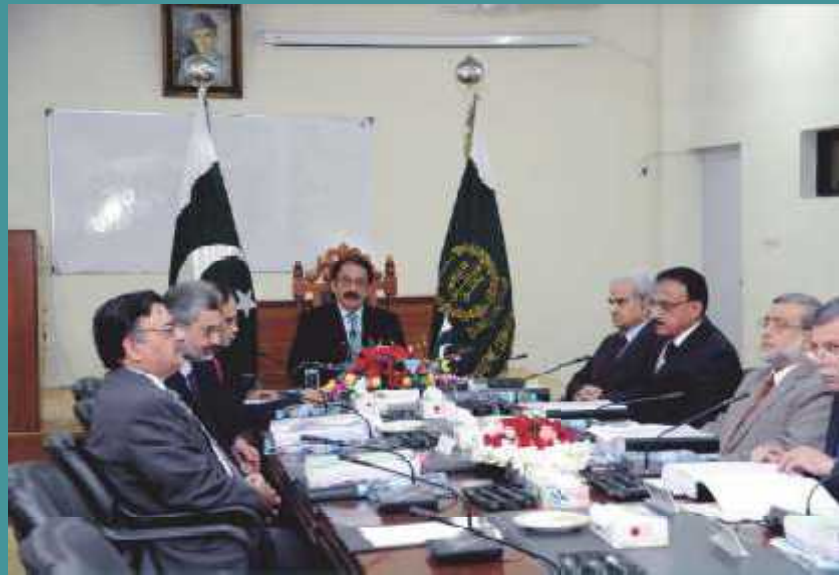
Meeting of Board of Governors of the FJA, in progress