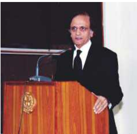
Hon'ble Mr. Justice Tassaduq Hussain Jillani addressing the course participants

Hon'ble Mr. Justice Tassaduq Hussain Jillani