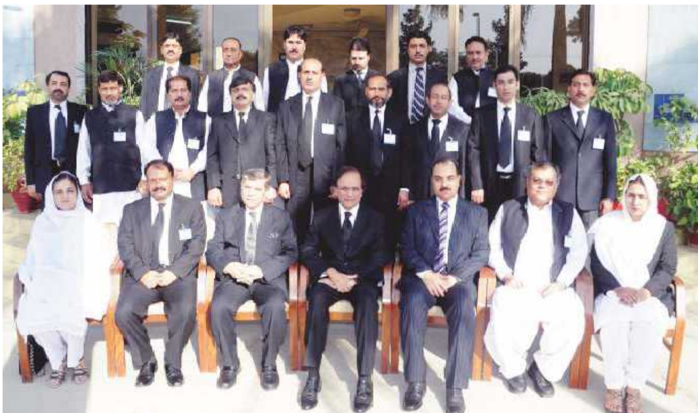
Participants of the course in a group photo with Hon'ble Mr. Justice Tassaduq Hussain Jilani and faculty of the Academy

Twenty senior civil judges participated in this one week training course at the Academy in which two were female, one from KPK district judiciary and the other from Balochistan district judiciary.