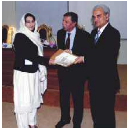
Hon'ble Mr. Justice Nasir-ul-Mulk gives away certificate to a participant

He lauded the content of the training course and said: “A wide range of topics have been covered during this training and I am confident that this training would be highly beneficial for you in your day to day affairs. As you know, this Academy is expanding, not only in its construction but also in the substance. Now we have back to back training courses here and I hope all of you will get a chance to come here for trainings. I appreciate the idea that trainees come from all parts of Pakistan including AJ&K and GB and they stay here and interact with each other, they develop bond of friendship and some people become friends for ever. These trainings are vital for judicial officers and their importance is internationally recognized nowadays. It is this training which gives you knowledge about new trends and skills in the world judiciary”.