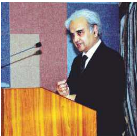
Hon'ble Mr. Justice Nasir-ul-Mulk addressing the gathering