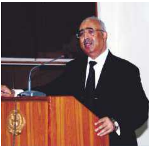
Hon'ble Mr. Justice Khilji Arif Hussain addressing the course participants

Hon'ble Mr. Justice Khilji Arif Hussain, Judge, Supreme Court of Pakistan observed that as we live in the economic world, awareness about the specialized subjects such as Intellectual Property Rights laws becomes more important for all of us including the judges.