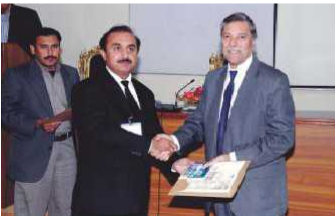
D.G., FJA gives away certificate to a participant

He further said: “One of the objectives of such like trainings is to provide fundamental knowledge to the trainees and also to provide a proper platform to the subjects under our mandate of the Academy where they can share their views with each other and learn from each others' experience in the relevant field. I am confident that you people who come from different parts of Pakistan including Azad Jammu and Kashmir and Gilgit-Baltistan would have learnt a lot from each other and hopefully you would try to use the gained knowledge and wisdom in the field so that the ultimate aim of imparting speedy and inexpensive justice to the litigant public could be achieved”.